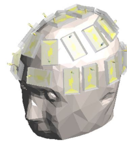
Fig. 1. MWI system: antennas' array with a helmet configuration.

The MWI system is applied to a numerical 3-D anthropomorphic phantom belonging to the national library of medicine [13] and obtained via analysis of cross-sectional cryosection of a human man and a human female body, available at [14]. The phantom composition is shown in Fig. 2 with the dielectric properties (permittivity \epsilon_r and conductivity \sigma ) at 1 GHz.