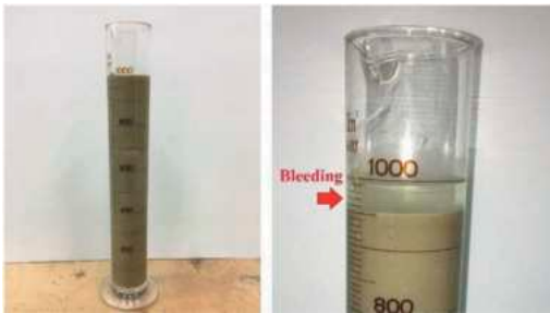
Figure 5. Bleeding assessment. (Todaro et al., 2023).