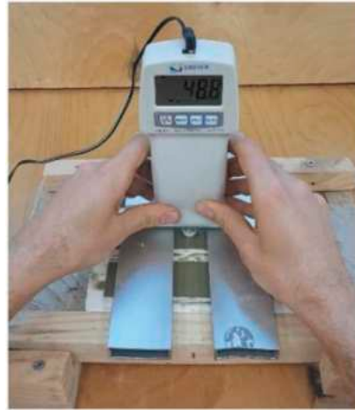
Figure 6. Dynamometer used for the surface compression strength assessment during the test. Todaro et al. (2020).

The test consists of the penetration of the bit orthogonally on the cast surface of the grout (previously cast in moulds with the shape in compliance to CEN (2016) and cured for 1 or 3 hours in a sealed environment) till a penetration of 5 mm is reached. The maximum force ( F in equation 2) reached during the test is recorded. SCS is consequently computed according to equation (2) where F is expressed in N.