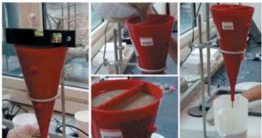
Figure 4. Marsh funnel used for the flow time assessment (Todaro et al., 2023).

The flow time was assessed by using the Marsh funnel (Figure 4), in line with UNI 11152-13 (2005). This test provides indications on the viscosity of the tested material. The outcome of the test is the time spent by 1 L of mortar to flow through the funnel. The higher the viscosity of the mortar, the higher the flow time.