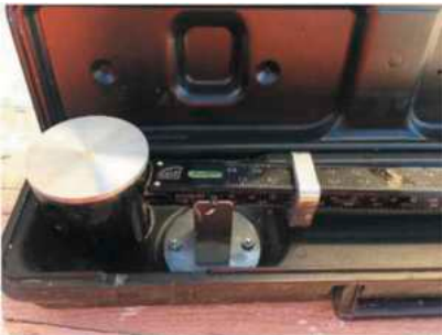
Figure 3. Mud balance used for the unit weight assessment. (Todaro et al., 2023).

The unit weight was assessed by using a mud balance (Figure 3), according to the standard ASTM D4380 (2020).