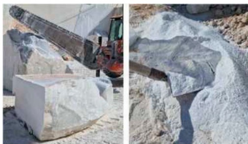
Figure 2. Chain cutting machine used for splitting the marble blocks in slabs (on the left) and the marble sludge obtained during this cutting operation (on the right).

Considering the ornamental stone processing chain, the cutting operations are important since blocks of huge dimensions ( \text{m}^3 of order of magnitude) are split into easily transportable slabs, suitable for further processing (Figure 2, left). Taking into account the Italian scenario, marble quarries are by far the most common, yet other types of ornamental stone quarries are also present on the national territory. For the reason of “abundance”, authors have selected marble sludge as an experimental ingredient in this study (Figure 2, right).