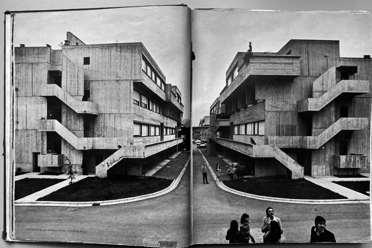
Fig. 1 - The Villaggio Matteotti in the two-pages photo by Gabriele Basilico published in the special section of "Casabella" dedicated to the complex. The image offers an inward-looking representation of the scheme, focused on the newly built public spaces and on the social life within them. Source: De Carlo et al., 1977: 24-25.