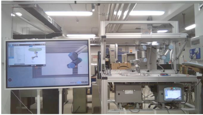
Figure 3. Real-time simulation complimented with additional information on the process.

Beyond to the synchronous learning mode, we have also introduced an asynchronous learning modality, via which the students can select a variable number of procedures to be executed by the virtual robots. These procedures are loaded into the application by the teaching staff together with a series of questions and corresponding answers, that are shown to the user during execution. Before a question is displayed, the robot movement execution is interrupted so that the student can choose a response from the available multiple-choice answers; only after that the execution can resume until the next question appears or the end of the procedure is reached. Beyond the operational procedures, information and guidance related to the maintenance of the mechanical and electrical components of the systems can also be displayed in the application. Furthermore, in event of an error or failure, the correct procedure to perform the maintenance operation can be indicated, as a step-by-step guide. This second mode can be interpreted both as a learning model and as an evaluation tool with the main objective being the enhancement of the learning experience.