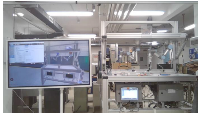
Figure 2. The physical laboratory and its virtual replica.

Digital Twin. In technical terms, this process concerned the creation of the 3D models (i.e., the laboratory space, the articulated robot), as well as the configuration of the interactivity elements (i.e., the values that would define the movements and the rotation capabilities of the robot). Oftentimes, this step can be the first issue to overcome at the early design phase.