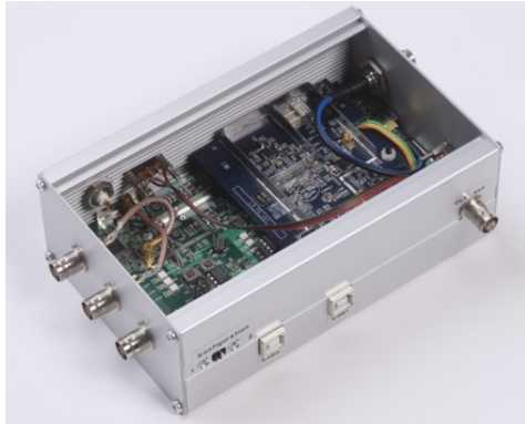
(a) TriBand USB2.0 Front-end from 2006