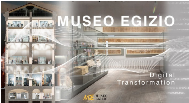
Figure 1: The metaphoric depiction of the digital transformation of the Museo Egizio involving collection, workflows and building management.