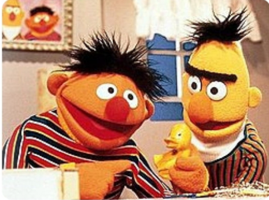
(a) Meme with a neutral image and offensive text.

Ernie and Bert proudly displaying the rubber duck they inserted into the screaming hooker earlier