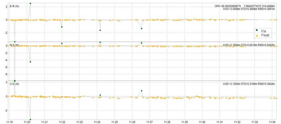
Figure 4. RTK positioning performance using smartphone rover within SPIN3 (geodetic-grade) network.