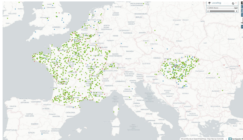
Figure 2. Coverage of the Centipede Network ( https://map.centipede-rtk.org/ , accessed on 24 May 2025).

composed of approximately 700 GNSS CORSs established by public institutions, individual users, and commercial operators worldwide (Figure 2). The density of GNSS stations varies due to the volunteer-based nature of the network, leading to incomplete geographic coverage. A recent study evaluated the performance of Centipede CORS in a comparative analysis, confirming both the potential and the limitations of this community-driven infrastructure [10]. Most of the stations are located in France, with some coverage extending into other countries. The project is financially supported by the Institut national de la recherche agronomique (INRAE) and has benefited from contributions by research institutions, government agencies, and private organizations since its launch in 2019.