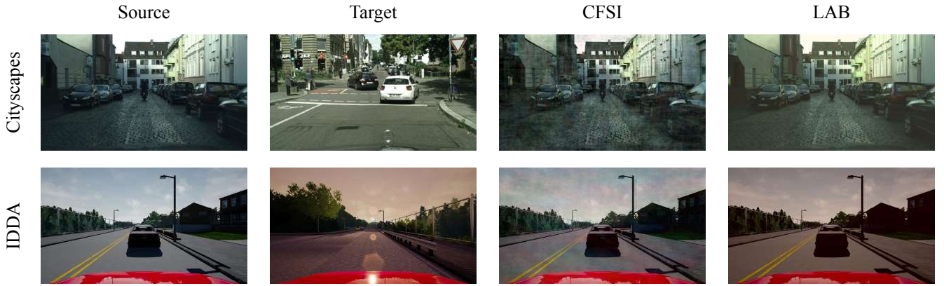
Fig. 2: Examples of DG techniques used to transfer the domain from a source to a target image. CFSI produces artifacts if the amplitude interpolation tends toward the target; otherwise, the difference from the original image is not as noticeable. The LAB technique appears to work well in all conditions since the style of target is clearly transferred to the source.

the statistics local to address the heterogeneity. New clients and domains at test time are handled using AdaBN [36], recomputing the BN statistics on the new testing domain while freezing all the other parameters of the server model. Both FedBN and SiloBN will be used as baselines in Sec. V.