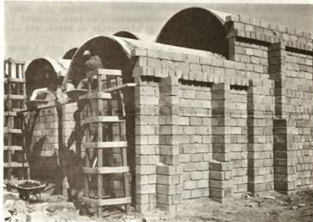
une école africaine