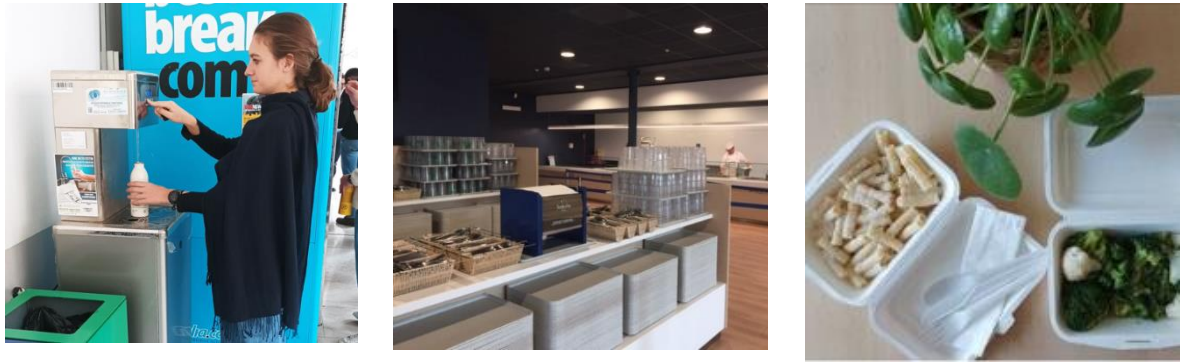
Figure 3. Activities related to the limitation of single plastic use

Regarding paper waste, specific printing policies have been developed to avoid the non-necessary use of paper. All printers and multifunction devices installed on the campus are “network connected” in order to manage the fleet remotely. This allows PoliTo to implement centralized printing managing policies on all the devices set on the campus (i.e., printing “front/read” by default, “economy mode” by default, etc.). A specific policy has been developed by the IT department to ensure that users print with limited “quotas” controlled centrally by means of specialized management software (PaperCUT). In fact, PaperCUT define a specific amount of printable copies for each user, especially students, with warnings and alarms dispatched on the approximation of the “quota”. The tool allows the university to increase the accountability of printing services and improve the awareness of users stimulating correct uses and behaviors. Specific communications and “advertising” integrated with flyers are located near the printing areas and in front of the devices to encourage users to better print and copy.