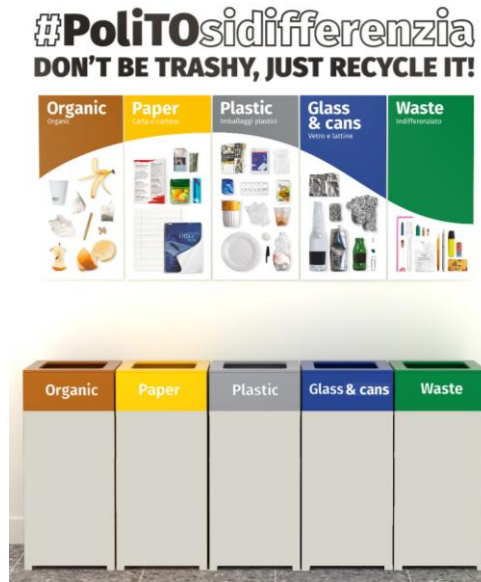
Figure 2. New recycling areas

PoliTo has an extensive recycling policy. All wasted materials are collected in differentiated bins for the following waste fractions, paper, plastic, glass and cans, organic, and unsorted. The recycling islands have a standardized visual identity in order to facilitate the disposal of waste from the university's users (Figure 2). Dedicated collection processes concern the recycling of special waste such as toxic materials, batteries, and EEE waste.