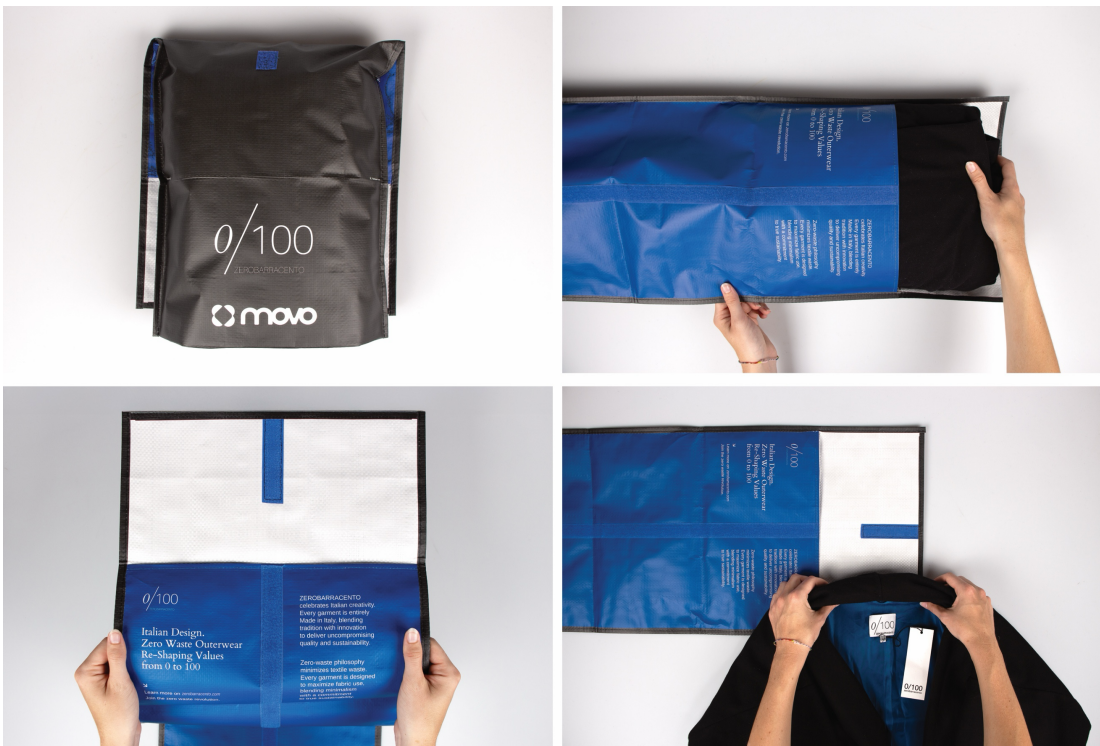
Fig. 1 Prototype of the reusable packaging for ZEROBARRACENTO produced by Movopack. Graphics by L. Rosato, developed within the FuturE-Pack project.

Packaging manufacturer Movopack was chosen for its focus on circular solutions and the "packaging-as-a-service" model it uses in e-commerce, which significantly reduces waste compared to single-use solutions. Its packaging is made from recycled polypropylene (PP), R-PET, and polyester; it is durable, lightweight, waterproof, and reusable up to twenty times. After use, it can be folded and returned via any mailbox using a prepaid label and QR code, sanitised, and recirculated. Movopack's highly customisable formats also function as branding and communication tools. For the Luciana overcoat, one of the largest items in ZEROBARRACENTO's collection, Movopack