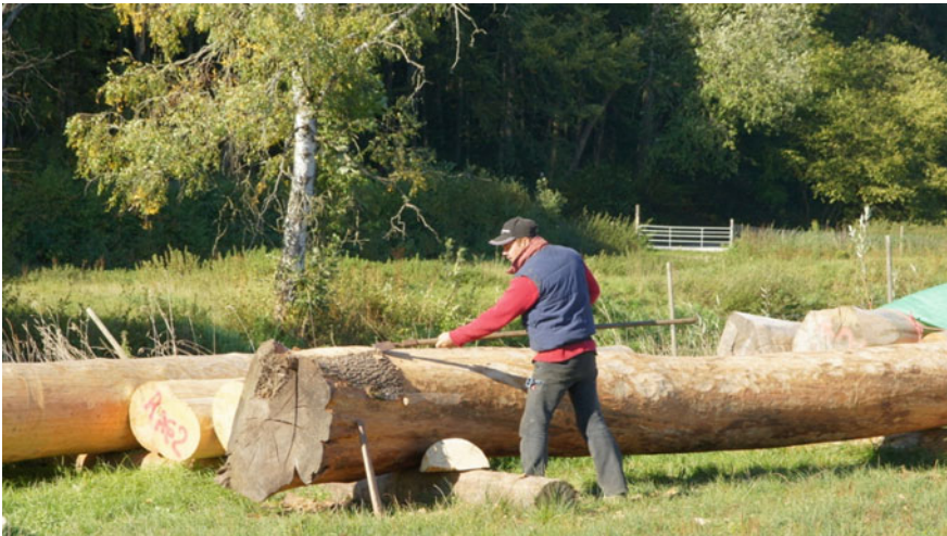
Fig. 33.3 Manual debarking of trees at Biotal site. Untreated logs are used as structural columns in the building.