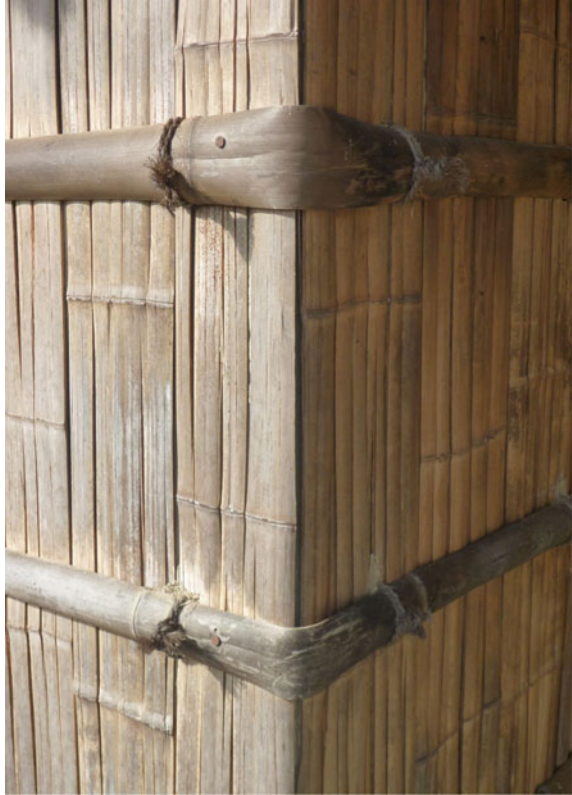
Fig. 33.5 Bamboo mats in Iya Valley, Japan.

Analogously, there are no data for loose flax fibres (21), just for mats. In ÖBD, the same assumptions as for hemp fibre mats are applied. ICE V2.0 reports that most of the impacts are due to the polyester binders and fire retardants (Schmidt et al. 2004). No data are present in either database for reed mats (4, 6) and jute (6), while building paper (10, 13) is covered by ÖBD only.