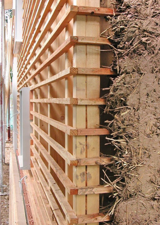
Fig. 33.6 Light-earth external skin applied onto battens in a new house in Darmstadt.

No data are provided for earth paints, which are usually ready-made products (4, 8).