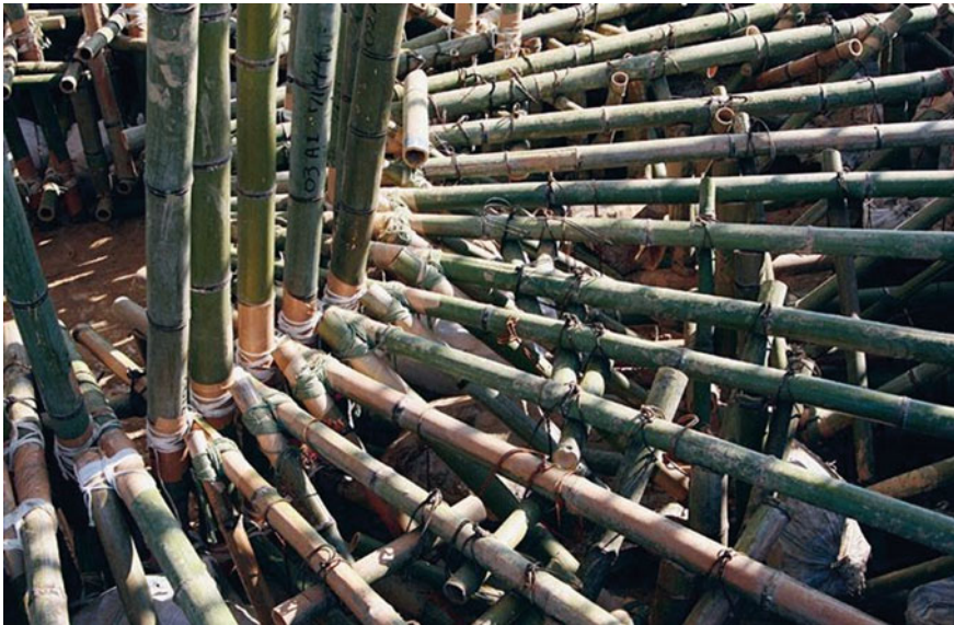
Fig. 33.4 Structure of the Bamboo Ark consists of radially arranged frames, composed of a base truss and arches. The culms were harvested from a nearby grove.

Databases seem also ill-suited for representing other vegetal materials. No data are present in either database for bamboo, not only for whole culms but also for products such as mats, panels, and laminated bamboo. In 9, locally harvested bamboo culms make up the entire structure (Fig. 33.4). Loose hemp shiv is not covered, which makes it difficult to assess, for instance, hemp-lime building components (8, 13). Only hemp mats are found in ÖBD (Fig. 33.5): these include 15% polyester fibres and are impregnated with soda.