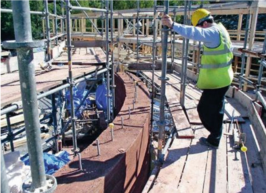
Fig. 33.7 Construction of the lecture theatre of the WISE at the Centre for Alternative Technology. The attractive load-bearing rammed-earth walls, 500 mm thick, are pneumatically tamped and left unfinished on both faces.

Emblematic is the case of stone: while being one of the most common materials in vernacular constructions, its use has drastically shifted from massive blocks that require minimal (if any) dressing to 1 ~ 3-cm-thick cladding slats. Both databases just provide values for thin elements that underwent cutting and finishing processes. In ÖBD, entries for 2 ~ 4-cm-thick granite and limestone elements assume processing—steel grit, grinding road, saw, and multi-blade saw. ICE V2.0 acknowledges that data sources were generally poor, except for stone slates. Quarried stone blocks are then associated with a risk of overestimating their embodied impacts if the custom values are employed. Even in cases when thin paving stone slabs were used, ecological considerations resulted in specifying little-processed elements: in 7, 50 ~ 70-mm-thick soapstone flooring slabs were obtained on site by cutting conglomerate rock boulders; in 21, 9-mm natural stone tiles were hand-cut with pliers and left unpolished.