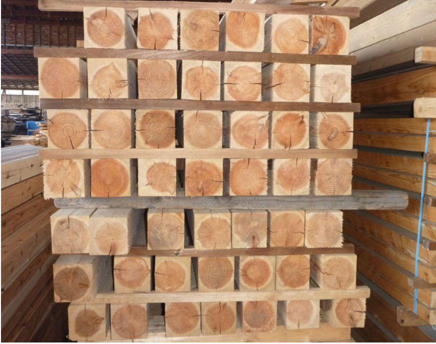
Fig. 33.2 Timber dried at low temperatures in a greenhouse at Kitokuras sawmill (Kagawa prefecture).