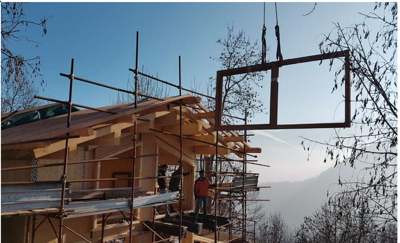
Fig. 5 Installation of the three-pane passive windows, with frames made of chestnut wood from regional supply chains, insulated with cork from Southern Italy.

I imagine that an important part of your research is to share knowledge and experience not