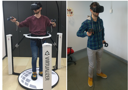
Figure 1: Cyberith Virtualizer treadmill and Arm Swinging locomotion methods.

As said, a number of works focused on analyzing results achieved by comparing the various techniques. For instance, in [BKH97], Bowman, Koller and Hodges operated a comparison between different techniques for moving inside immersive VEs with head tracking and HMDs while using 3D spatial input devices for interaction, but they did not include techniques based on physical user motion. By using the Myo Armband as wearable tracking device, Wilson et al. made a comparison between natural walking, WIP and AS [WKMW16]. In case of AS and WIP, the direction of gaze was used as direction for the generated movement, thus preventing looking around while moving. Given these premises, the result of the comparison showed the dominance of natural walk over the other two methods, while WIP resulted as slightly better than AS in terms of turning error. In [NSN13], Nilsson, Serafin and Nordahl operated a comparison between keyboard movement, Hip Movement (HM), a technique in which the user swings left and right the hip to generate motion, WIP and AS. Both WIP and AS were perceived as more natural than HM and keyboard, but AS better represented real walking in terms of physical effort and, led to lower positional drifts. Ferracani et al. [FPB*16] compared four interaction methods, i.e., WIP, AS, (finger) Tap (in the direction the user wants to walk) and Push (closing and opening the hand while