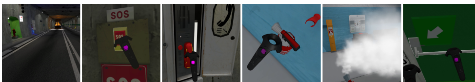
Figure 2: Screenshots from the FréjusVR application: fire event scenario and available interactions.

cylinder (one meter radius) around the user in order to prevent walk while preserving the HMD freedom of movement.