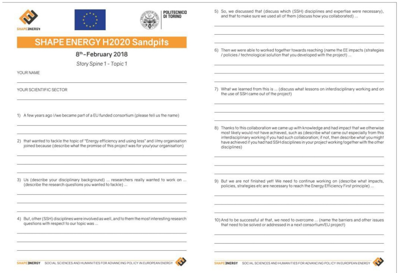
Fig. 3. Story spine used in the first day of the sandpit.

final plenary sessions when the final proposals were presented and discussed also with guest panellists. Through the story spine form used during the first day of the sandpits (Figs. 3 and 4), participants were asked to describe their projects' objectives, and we collected a total of 47 'energy stories'.