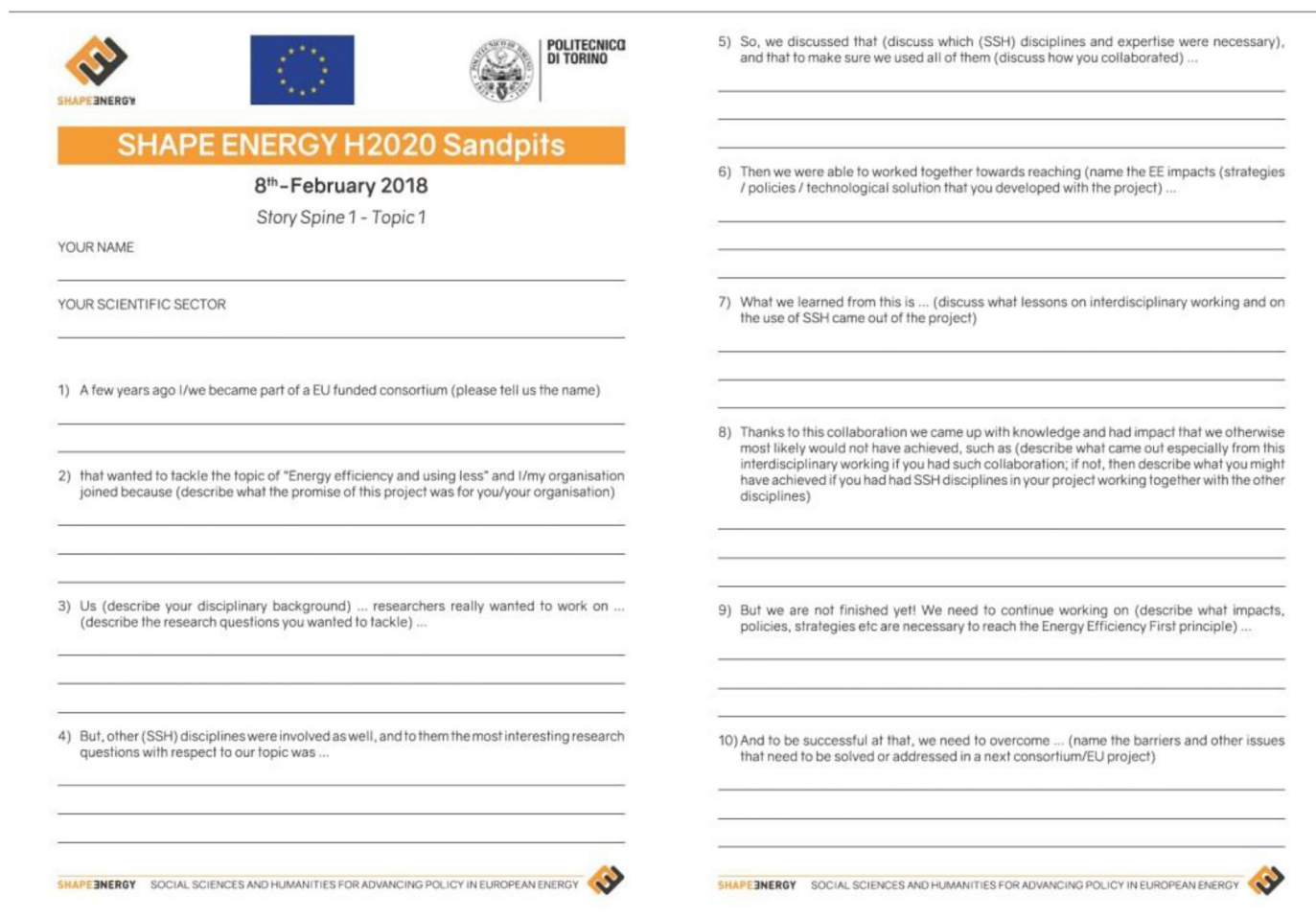
Fig. 3. Story spine used in the first day of the sandpit.

final plenary sessions when the final proposals were presented and discussed also with guest panellists. Through the story spine form used during the first day of the sandpits (Figs. 3 and 4), participants were asked to describe their projects' objectives, and we collected a total of 47 'energy stories'.