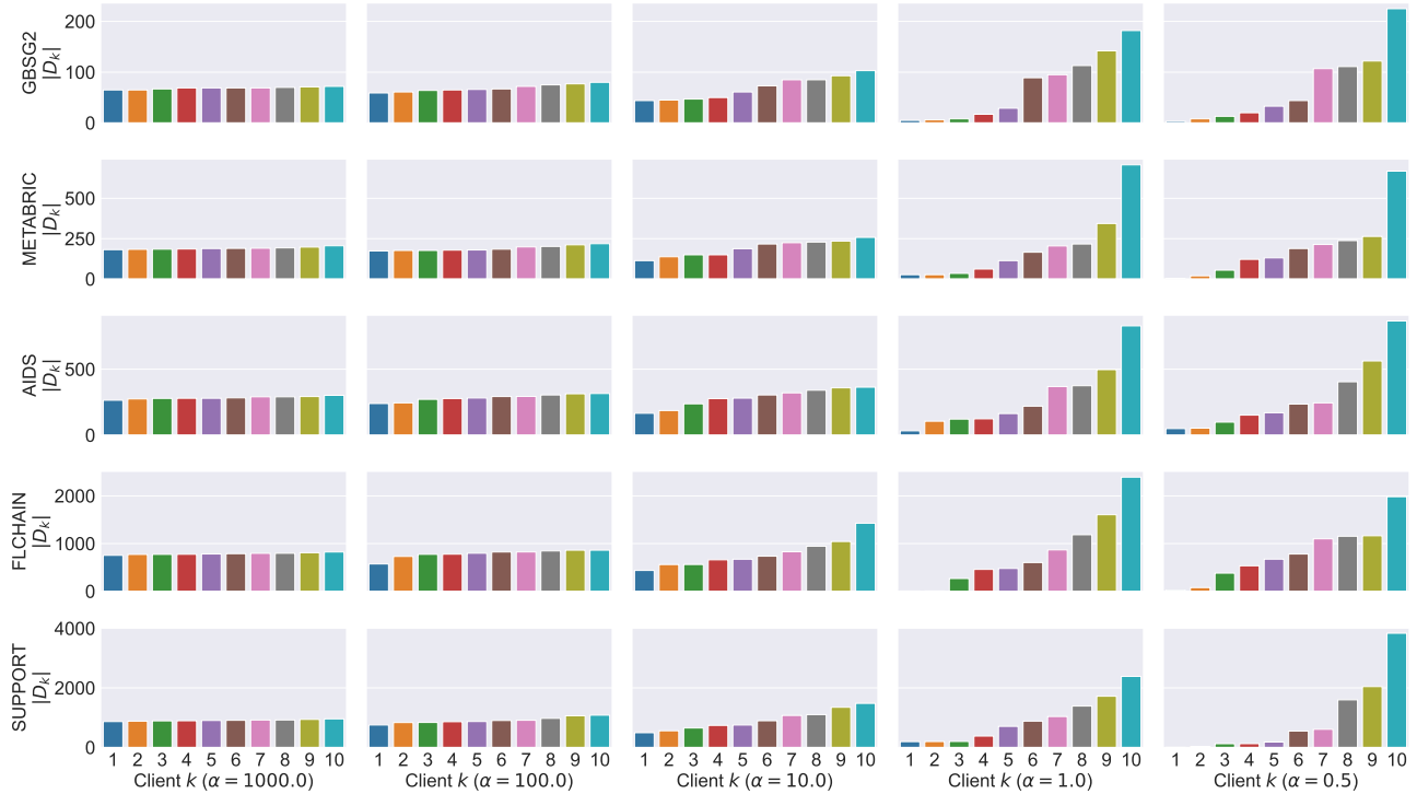
Fig. 1. Number of samples |D_k| for each client k = 1, \dots, 10 . Each row refers to one of the datasets described in Section IV-A. Each column corresponds to a quantity-skewed split (Section III-A) with a fixed similarity parameter \alpha .