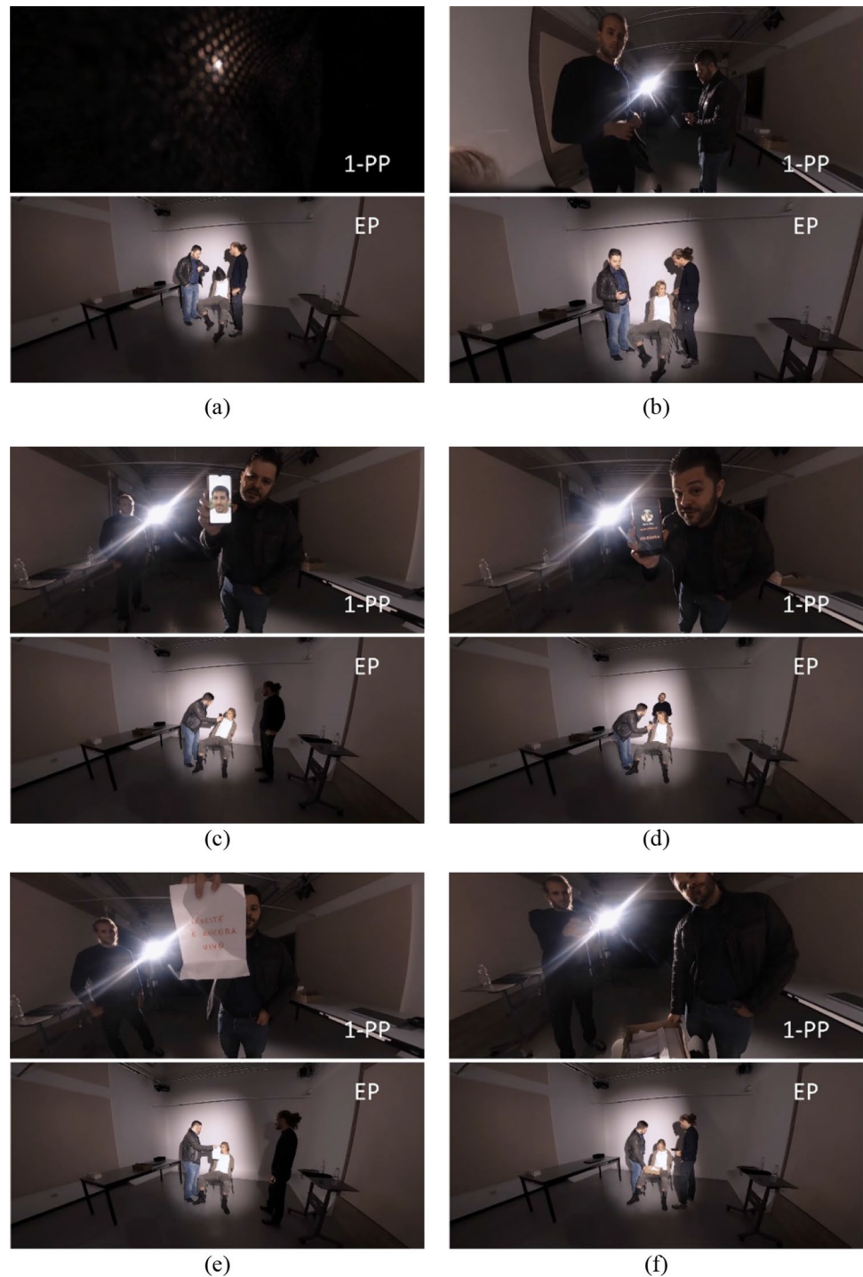
Fig. 1 Key elements in the second script as viewed in the 1-PP version (top) and the EP version (bottom)

of the dialogs was recorded using the microphones of the camera. Sena's thoughts were captured in a dedicated recording session using a ZOOM H5 handy recorder. The movie underwent the same post-production steps described for the first script. In addition, to differentiate the spoken parts and Sena's thoughts, a reverb effect was