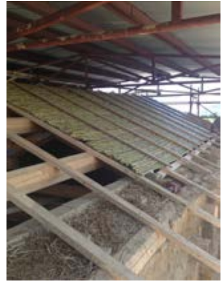
Figure 25: Laying of the laths made during the 2015 workshop (CEDTerra)

better distribute the loads (Fig. 24). Joists placed above the beams support the brick flooring.