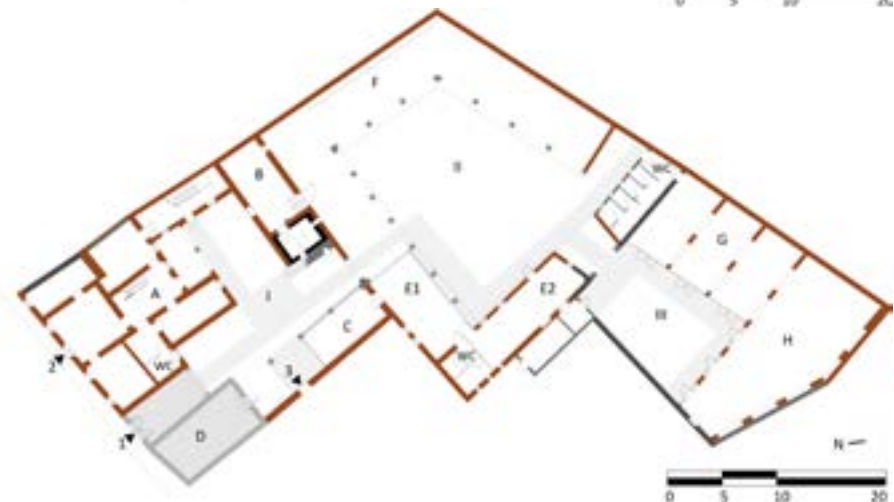
Figure 6: Project plan, ground floor. Courtyard I: A) exhibition rooms and tourist agency; B) storerooms; C) tasting rooms; D) Villa Fenu; 1) portal and entrance hall to the courtyard; 2) main entrance; 3) connection to Villa Fenu. Courtyard II: E1) cafeteria and E2) kitchens; F) exhibition area. Courtyard III: G) workshop and laboratories; H) conference room. Red: ladriri masonry; black: concrete; dark grey: stone masonry; grey: fired bricks and hollow bricks