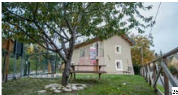
Figure 28: Massoni walls left without plaster on first floor to the west