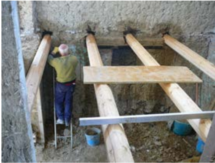
Figure 24: Laying the new beams in the west room (CEDTerra)