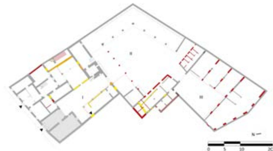
Figure 6: Project plan, ground floor.

Courtyard I: A) exhibition rooms and tourist agency; B) storerooms; C) tasting rooms; D) Villa Fenu; 1) portal and entrance hall to the courtyard; 2) main entrance; 3) connection to Villa Fenu.