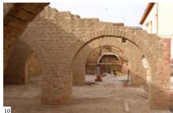
Figure 7: In the reconstruction work of building B, the reuse of original ladiri in good condition was frequent. The earth derived from the demolition, heterogeneous and with spurious materials, was not reused within the construction site, but was instead reused to fill the land where the earth used for the new bricks was extracted from. (Ignazio Garau)