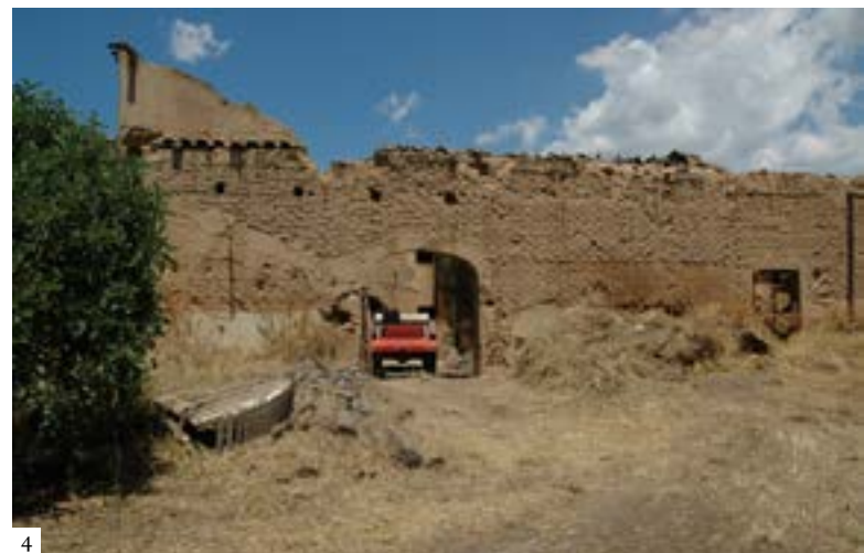
Figure 3: Outer walls of the oxen courtyard (II) in 2005 (Ignazio Garau)