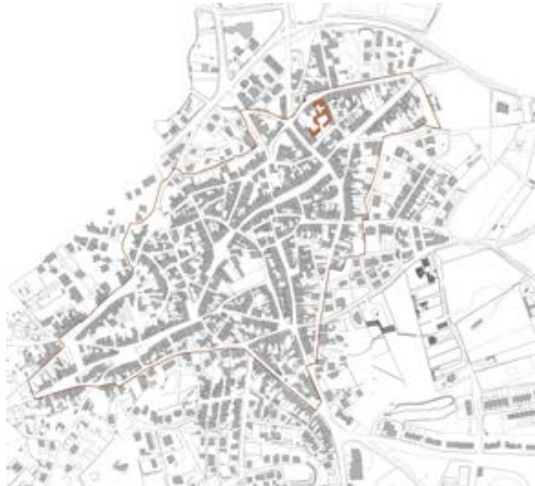
Figure 2: Earth houses tour in and around Casalincontrada. The Casa di Teresa is marked in red (CEDTerra)