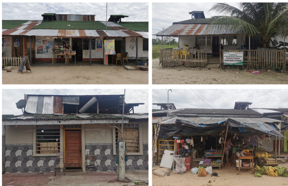
Figure 2. Transformation to houses in Nuevo Belén done by residents.

The continuous imposition of “universal” urban models and planning regulations threatens the invisible interdependency between settlements and the forest. While the current living conditions in flooding settlements present hazards, the relocation of these settlements away from the river and away from urban services obliterates indigenous modes of living and inhabiting, limiting the possibilities of learning from them towards