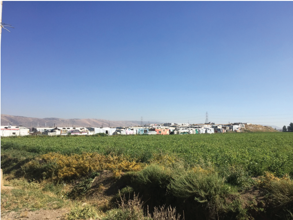
Figure 3. Informal Tented Settlement Bar Elias-Tell Serhoun in an agricultural landscape.