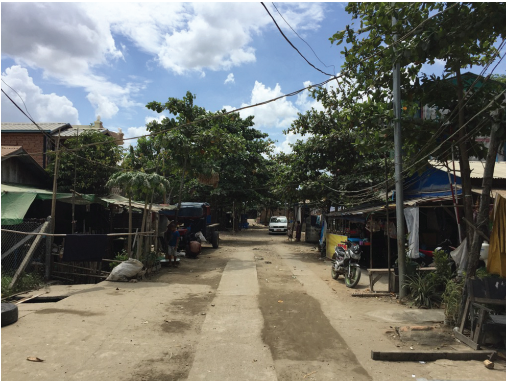
Figure 4. Hlaingtharyar urban landscape in the making.

In Hlaingtharyar the act of inhabiting the supposedly uninhabitable becomes the right to stay put, to resist the hypermobility and permanent displaceability to which people are forced into (Figure 4). It also becomes the right to transform and repair; the right to change domestic interiors, to expand, extend, trespass and occupy the surroundings. Between plots of empty farmlands, garment factories and unploughed fields, new housing projects continue to be built (Kolovou Kouri and Sakuma 2021; Kolovou Kouri et al. 2023). Collectives of residents’ forged relations, enhance connectedness, get attached to places, and make home (Astolfo 2023). These acts don’t counterpose but rather are