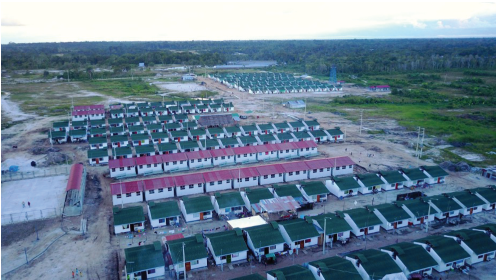
Figure 1. Houses in Nuevo Belén.

The newly established settlement, Nuevo Belén, is located 13.5 km from the centre of Iquitos and, due to the poor conditions of the road, it takes over an hour by bus to travel between them. This shift has not only meant extended travel time and increased costs of travelling, as Belenians usually walked around the city or moved using boats in the floating area, but also an increase in gender inequality as women stay in the new site, unable to work or sell products in the market. Their inability to work has increased their dependence on men to generate income (Chávez 2021). The housing and spaces provided in Nuevo Belén exhibit significant disparities when compared to houses in the old