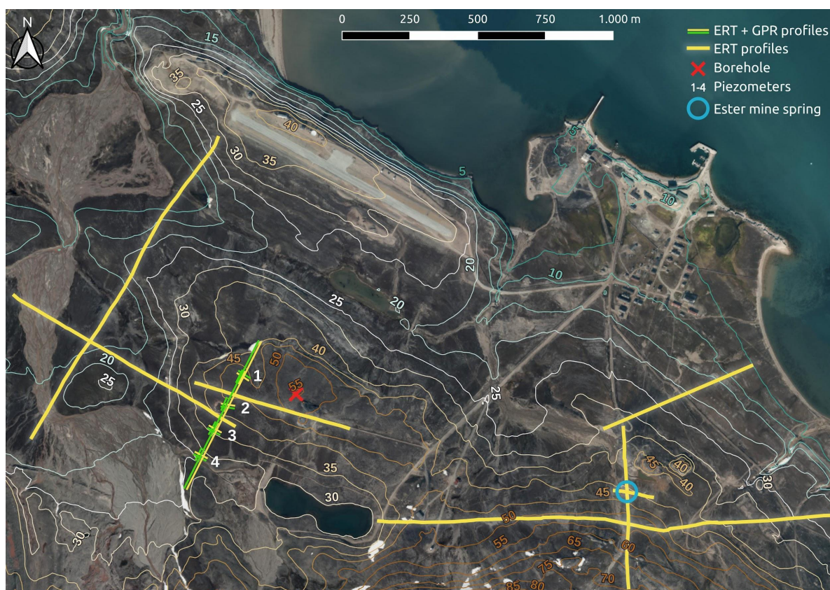
Fig. 1 – Map of the geophysical campaign carried out in Ny-Ålesund (Svalbard) in the summer of 2022. The ERT profiles are plotted in yellow and the GPR profiles in green. The investigated area on the west is the Bayelva river basin, while that on the east is the former mine. The piezometers are indicated with white numbers. The red cross is a recent borehole (48.5 m deep). The blue circle indicates the position of a spring (Haldorsen and Heim, 1999).

GPR measurements with 40 MHz and 400 MHz antennas were carried out in the area of the Climate Change Tower, close to the four piezometers aforementioned, for a total of around 2 km of GPR lines. Coincident ERT and GPR profiles with different acquisition settings were designed along the line of piezometers in order to correlate the geophysical results with the geochemical data and water table information coming from the piezometer monitoring (see Fig. 1).