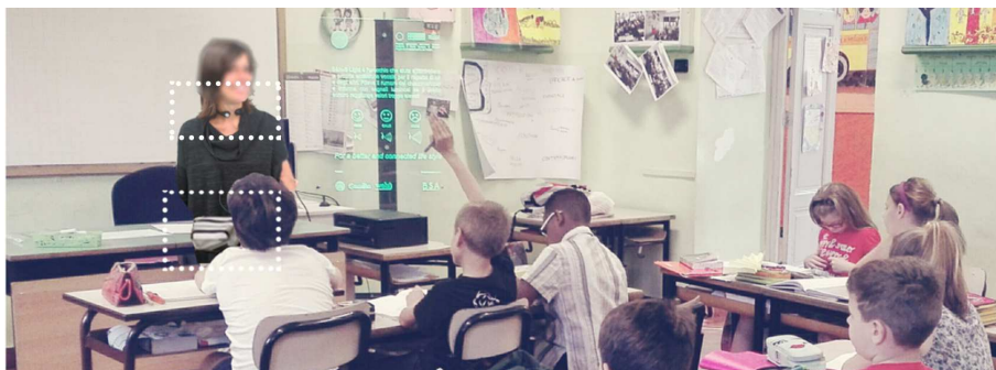
Figure 1 - An example of long-term voice monitoring in a classroom during P2 with the lighting of SEM device switched on. The contact microphone connected to the smartphone are marked white dots shape.

The long-term voice monitoring was carried out using a portable vocal analyzer, based on Voice Care technology, that has been developed at the Politecnico di Torino by Carullo et al. [10-12]. This device consists of a Piezoelectric Contact Microphone (HX-505-1-1, Shenzhen, China), embedded in a collar, that has been placed near the jugular notch to sense the acceleration of the skin caused by the vibration of the vocal folds (Figure 1). The sensor is connected to a smartphone (Samsung SM-G310Hn) where an application, the Vocal Holter App (by PR.O.VOICE, Turin, Italy), records the signals with a sampling rate of 22050 Hz and 16 bit of resolution. The App estimates the Sound Pressure Levels (SPLs) of the voice signal at a fixed distance from the speakers' mouth after the calibration procedure with a reference microphone [12].