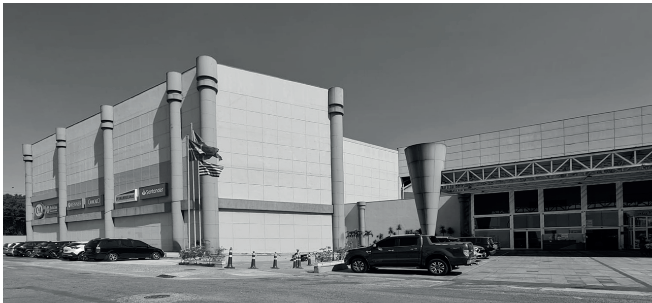
Figure 5 | International Shopping Center Guarulhos entrance today - © Giuliana Di Mari, 2022.

The Brazilian factory is placed into the category of form-resistant structures whose static behaviour is described by Sergio Musmeci as “characterised by stresses contained on the plane tangent to the roof (membrane stresses) whose bond with the loads acting locally on the vault is isostatic” 2 (Musmeci, 1969: 692).