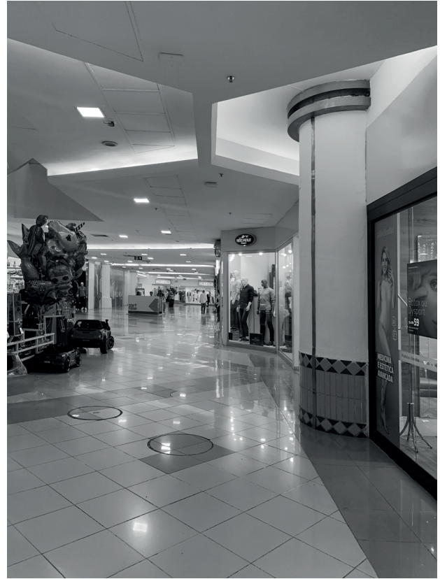
Figure 7 | International Shopping Center Guarulhos interior view of the part that was originally dedicated to the assembling area - © Giuliana Di Mari, 2022.

rather than technocracy. Zanuso found such a concept in Adriano Olivetti's production philosophy to a certain extent. Zanuso's factories for Olivetti were explorations of industrialised architecture. Through their reflection on the approach to architecture, and industrial design, these factories were distinctive investigations into the relationship between architecture and industrial design.