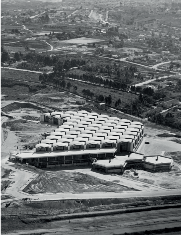
Figure 1 | Olivetti factory under construction. São Paulo, aerial photograph, 1959 - © Masami Kishi, Arquivo Histórico Municipal Araci Borges Dias Martins, Guarulhos. Tombo-3009.