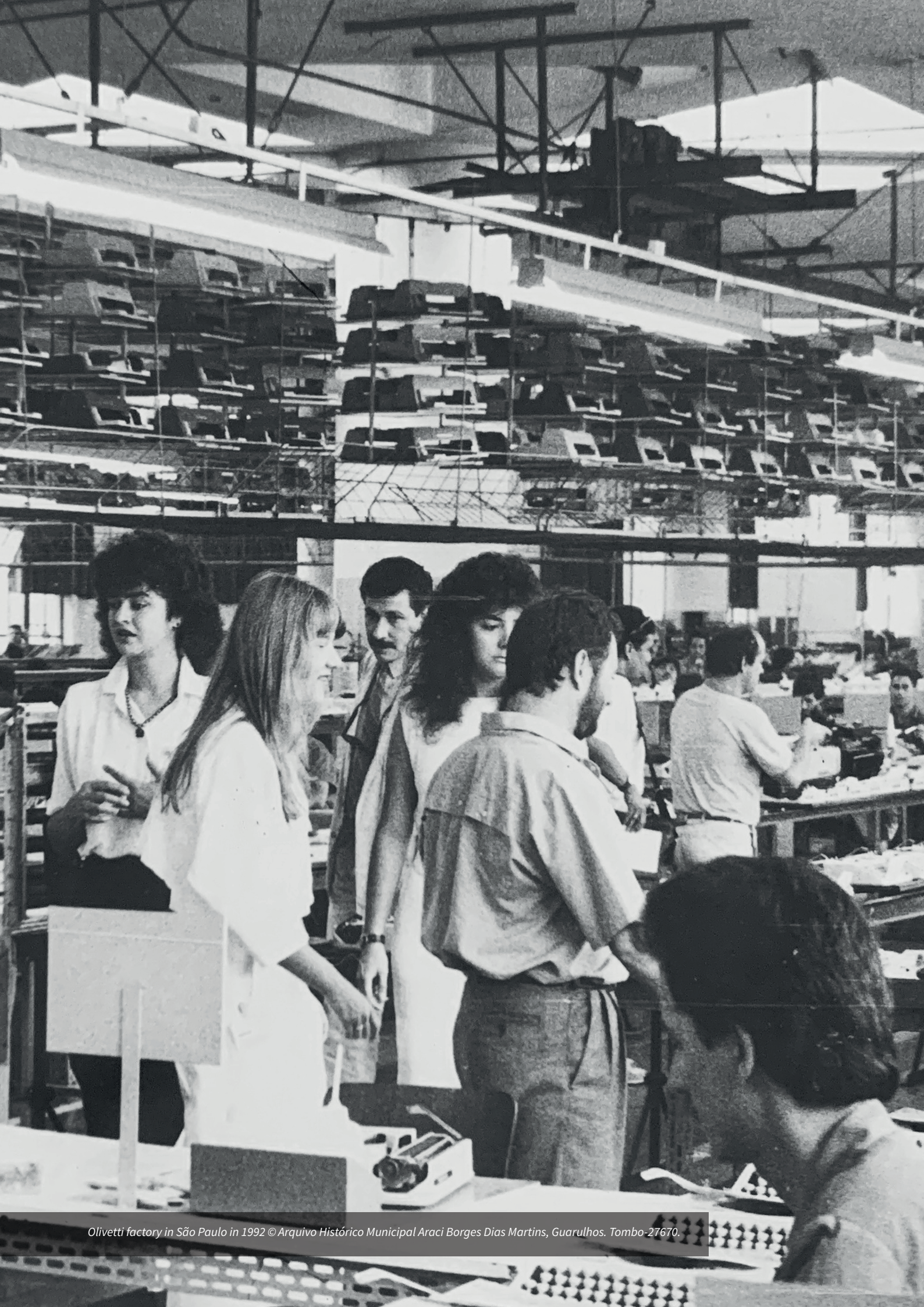
Olivetti factory in São Paulo in 1992