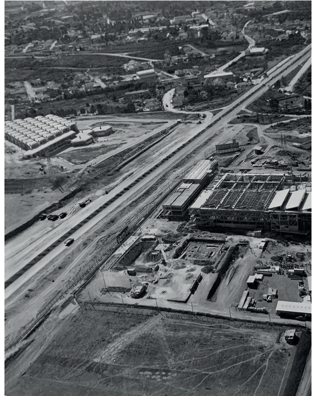
Figure 2 | Olivetti factory on the left and Philips factory on the right under construction. São Paulo, aerial photograph, 1959 - © Masami Kishi, Arquivo Histórico Municipal Araci Borges Dias Martins, Guarulhos. Tombo-3010.

him the “ topos of the contemporary technical environment” (Porta, 1982: 636), which leads him to approach Olivetti’s vision of the industry, so full of anthropological underlining of the workplace, grasping all its functional, productive, technological and sociological complexity.