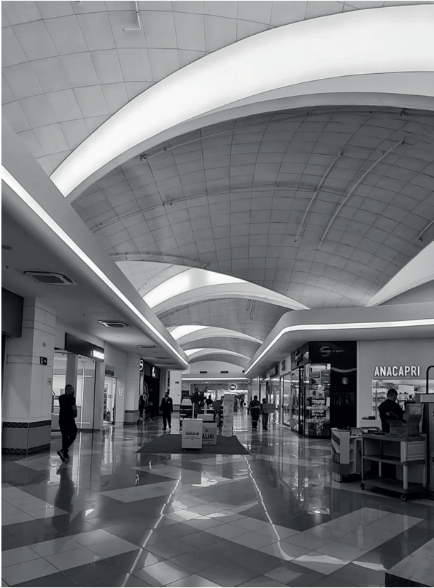
Figure 6 | International Shopping Center Guarulhos interior view of the vaulted part of the original factory