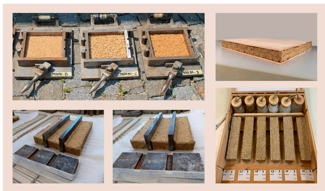
Figure 2. Examples of the samples created in the experimental phase to define the mix design.

The research generated a feasibility study for a panel made strictly of waste and byproducts of the rice supply chain that might be used as chipboard or as the inner layer of sandwich panels with wooden face sheets (Figure 2).