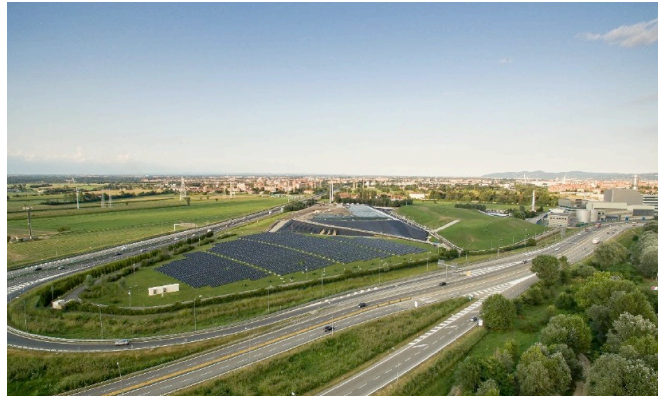
Figure 2. Photo of the Barricalla landfill.

The site is Eco-Management and Audit Scheme (EMAS) certified and subjected to the Integrated Pollution Prevention and Control (IPPC) authorization. Generally, the wastes conferred in this landfill are industrial sludge, railway ballasts, wastes from the treatment of flue gas of steel mills, ashes from incineration, land reclamation, and wastes from treatment plants. Two different kinds of analyses are performed on waste before its disposal: an analysis on the eluate and another on the solid waste.