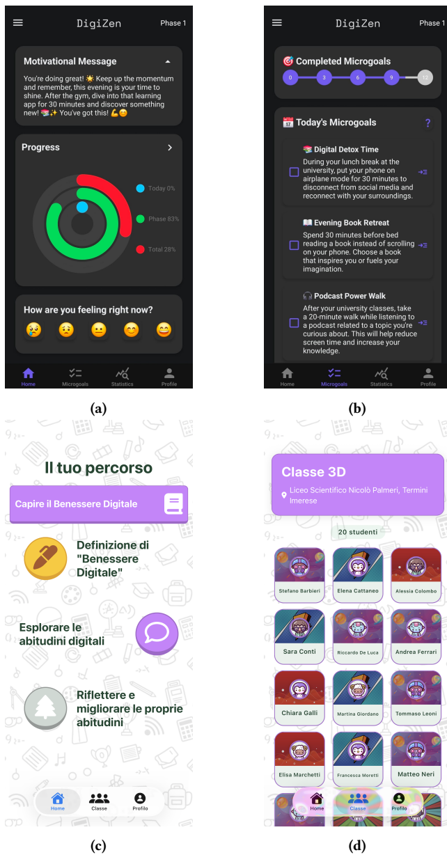
Figure 2: Figures (a) and (b) are screenshots from the DigiZen app, the first one is the home page of the application with a motivational message and the progress status, while the second shows the daily microgoals page. Figures (c) and (d) are from the student mobile application of the DigiTeens system, the former showing the home screen with the educational path activities, the latter is the class view of the same application.

collaboratively, depending on the teacher’s choices. In both cases, students are often exposed to aggregated class statistics, which are intended to encourage group reflection. The DigiTeens system has already undergone an initial in-the-lab evaluation with 13