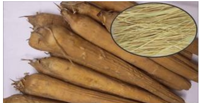
Fig.1 Tender palm shoots and central fiber

evaluated natural fiber as an alternative to man-made fiber in composites. In the present work, natural fibers are added so that at least a small quantity of plastic which is equal to the weight percentage of fiber is bared from usage. A comparative study was done on the effect of adding different proportions of reinforcement fibers (tender palm shoot central stem and palmyra palm fibers) and Al powder in epoxy resin. Epoxy is a well-known thermosetting plastic and it is widely used because of its low cost and easy formability. Despite its great potential, there is a negative effect on the environment because of the post consumed epoxy products, Virgin epoxy is not bio-degradable and on incineration of epoxy, toxic gases are released which are harmful to the environment. The tender palm shoot ( Borassus flabellifer ) is the part emerging from the centre portion of tender palm fruits. These shoots are thin and about 150 to 200 mm long.