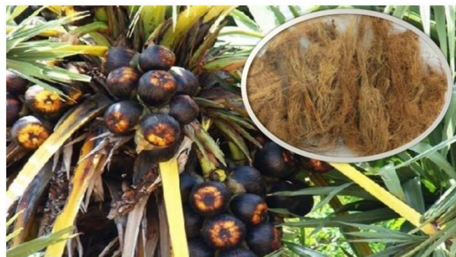
Fig. 2 Palmyra palm fruit with fibers

It is starch based root (shown in figure 1) surrounded by a thin fibre layers and a central stem. The part used for extraction of fiber is the central stem of the shoots which is a leftover part of the tender palm shoots.