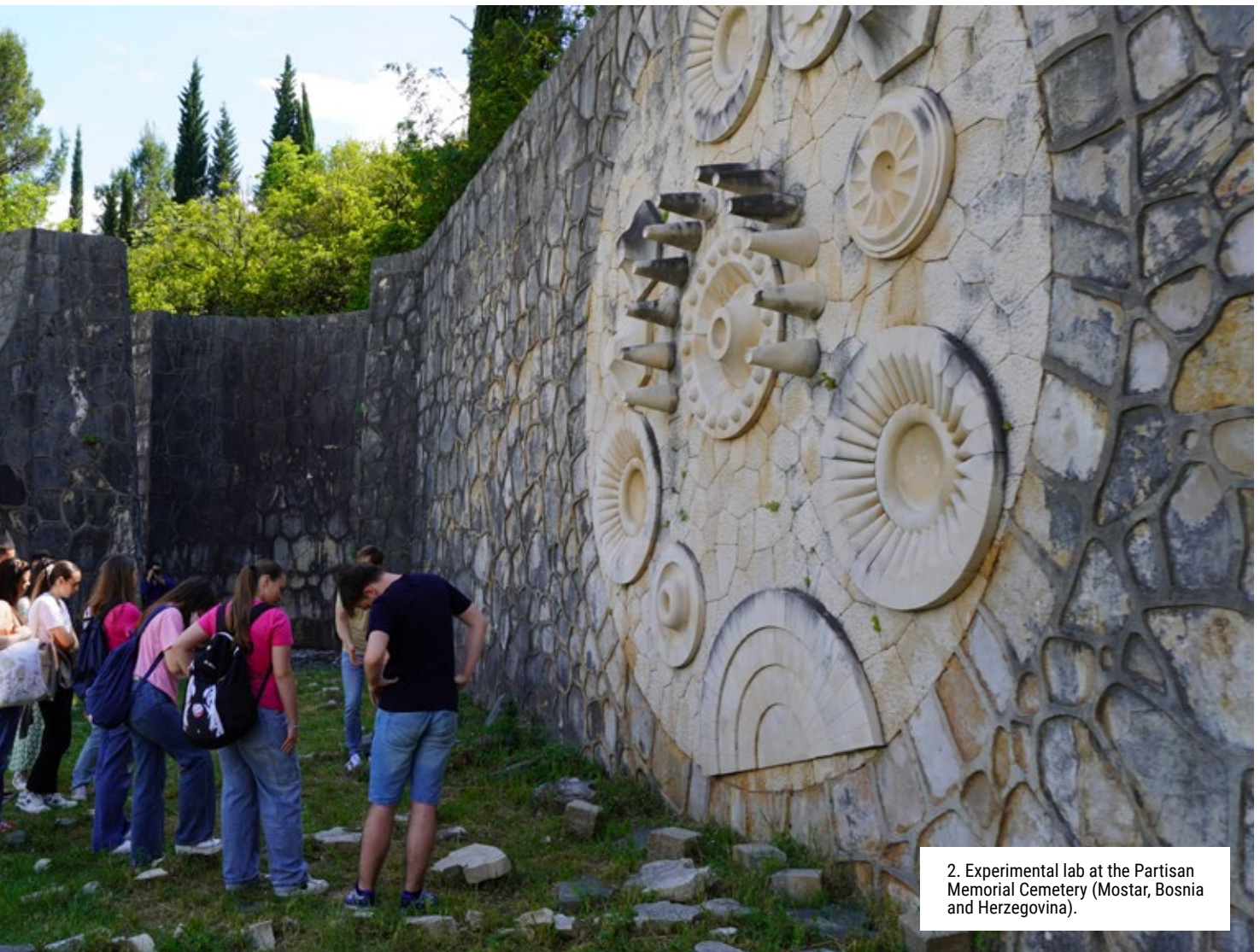
2. Experimental lab at the Partisan Memorial Cemetery (Mostar, Bosnia and Herzegovina).

World War. The Partisan Memorial Cemetery – locally known as Partiza – is a paradigmatic example of dissonant heritage. Commissioned by the Yugoslav government and designed by the architect Bogdan Bogdanović in the 1960s, it was conceived as a monumental tribute to the anti-fascist resistance and the ideals of brotherhood and unity among the peoples of Yugoslavia. During the socialist period, it was one of the most significant civic and commemorative spaces of the city, embodying the state's official narrative of collective heroism and national cohesion. The Bosnian War in the 1990s radically altered its meaning, and it became a symbol of division: the monument suffered damage and neglect, became the target of repeated vandalism, and progressively lost its civic function. Today, it remains a powerful but ambivalent site, oscillating between abandonment and attempts at symbolic reappropriation. The Mostar lab focused on perception through a dual methodological approach, integrating verbal and visual testimonies. On one hand, the research team conducted semi-structured interviews with selected experts – professors, researchers, architects, and directors of government institutions – to capture professional and personal interpretations of the cemetery's