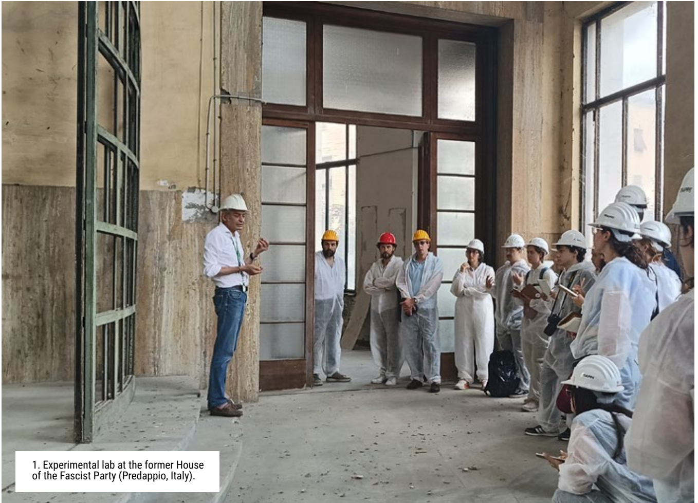
1. Experimental lab at the former House of the Fascist Party (Predappio, Italy).

but also cultural assets that are acquiring dissonance through a communication that manipulates stratified memory, with the aim of transforming them into a divisive element within the community. The project, now in its final phase, aims to explore innovative tools for identifying and managing this new way dissonance takes shape by mapping situations in which tensions emerge through manipulated communication, and analysing virtuous cases of re-signification of Dissonant Heritage. The goal is to outline targeted value-oriented strategies for the preservation and communication of these architectures.