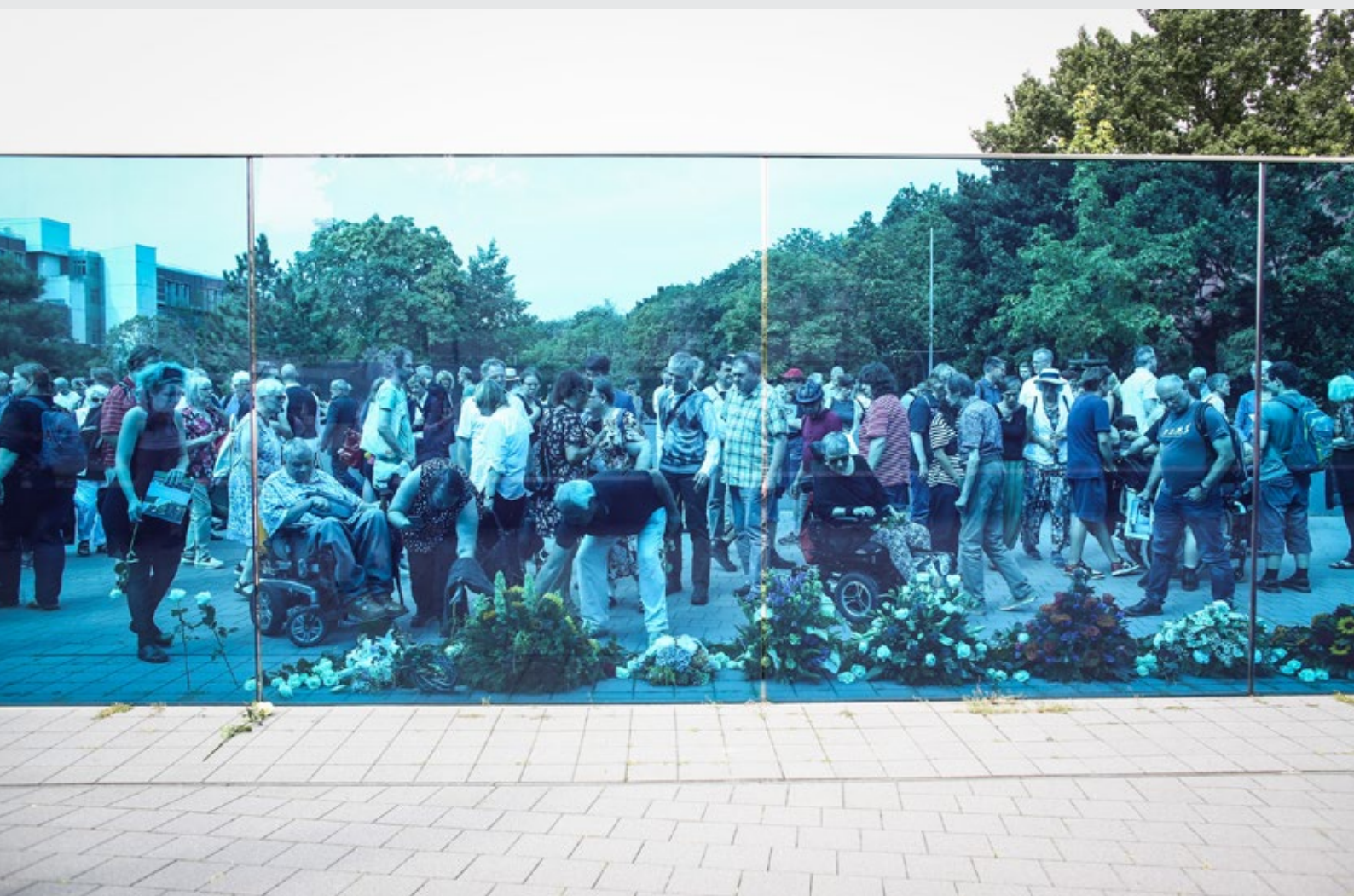
Commemoration of the 5th anniversary of the memorial and information site for the victims of the National Socialist euthanasia murders—the T4 Memorial—in Berlin (August, 2019).