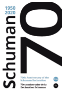
Schuman 70. 70th anniversary of the Schuman Declaration. [EUROM, 2020]