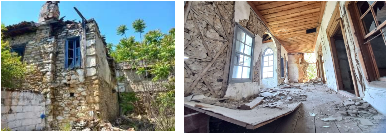
6: Yeşilbağcılar traditional dwellings in May 2022