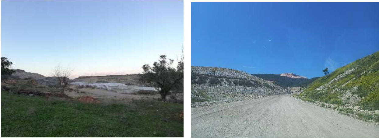
3: Bağyaka Coal Mine and Yeşilbağcılar Coal Mine Yatağan