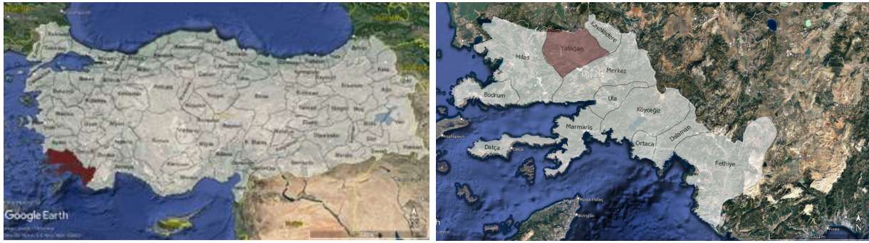
1: The location of the province of Muğla, Yatağan in the southwest of Turkey.

However, significant changes have occurred in Yatağan 's historical trajectory with the emergence of coal mining activities in the 1980s. This industrial sector gained prominence, dramatically impacting both the landscape and the socio-cultural fabric of the region. The establishment of the Thermal Power Plant and subsequent coal mining operations have had direct and indirect effects on the environment, altering land use patterns and causing the relocation of local communities. As a consequence, some traditional rural settlements, including Bağyaka , Kapubağ , Eskihisar , and Yeşilbağcılar villages, which once bore witness to the local and landscape history, now either stand in ruins or have been abandoned. This has led to the loss of traditional buildings and settlement patterns, which could serve as invaluable documentary sources, providing insights into the historical context, architectural practices, and social dynamics over time.