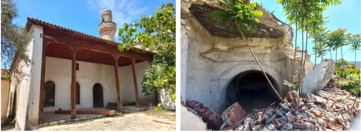
5: Pirli Bey Mosque and Yeşilbağcılar Turkish bath in May 2022

Yeşilbağcılar village is also known as Gibye where was depopulated and half of the settlement demolished due to coal mining extraction, vibration and landslides. Yeşilbağcılar has symbolic buildings like; Pirli Bey Mosque which is dated end of the 19 th century, the Pirli Bey tomb, and a Yeşilbağcılar Turkish bath (tr. Hamam ) which is dated 14-15. century. [Kunduraci 2021]. They are abandoned and ruin state now. Ekmekçi and Atasoy [Ekmekci, Atasoy 2009] described traditional dwellings of Yeşilbağcılar village as two story with outer sofa plan type. They were constructed with rubble stone masonry and timber frame and earth roofs. The dwellings have simple façades and decorated doors and cupboards in the inside which are dated 19 th and 20 th centuries. Presently, more than half of the traditional dwellings of Yeşilbağcılar demolished and others are in ruin state.