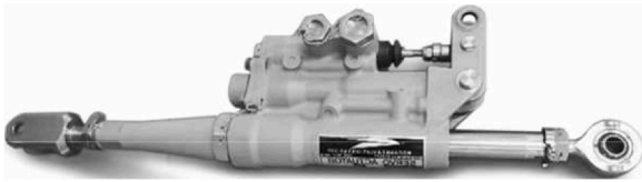
Fig. 2. Representation of the electromechanical actuator.