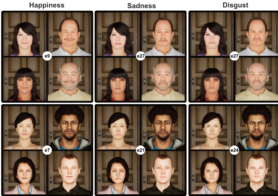
Figure 3. Top expressions of the three emotions for high-resolution VHs (top) and low-resolution VHs (bottom).