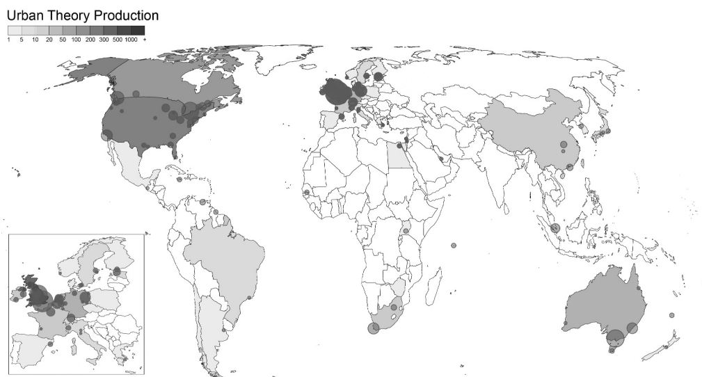
FIGURE 3 | Urban theory production.

choose to write a theoretical article or empirical research and case studies, from multiple margins, one can break the roof and finally be published in ‘international’ journals only if the article is not purely theoretical and if local case studies are presented. ‘Local scholars’, as Chann (2023) argues, are thus confined to thinking and acting only at the local level. Multiple margins enter urban knowledge production primarily as case study producers or, as Bhan (2019) suggests, as testimonies. This evidence is clearly in line with the arguments of some scholars (e.g., Scott and Storper 2015; Storper and Scott 2016; Randolph and Storper 2023), who call for the adoption of universal concepts (firmly located and produced in Western, actually Anglo-American, centres) and empirical variegation, while practically contradicting the opposing attempts to provincialize any urban knowledge and ground any theoretical reflection (e.g., Edenson and Jayne 2012; Roy 2009, 2016; Sheppard, Leitner, and Maringanti 2013; Amin and Lancione 2022).