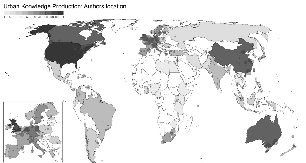
FIGURE 1 | Urban knowledge production: Authors' location.

the list are in English-speaking countries (or in countries more or less directly influenced by the UK), the 'linguistic privilege' reasserts itself, adding for some of them, notably London, Chicago, and Los Angeles, as the paradigmatic milestones of modern