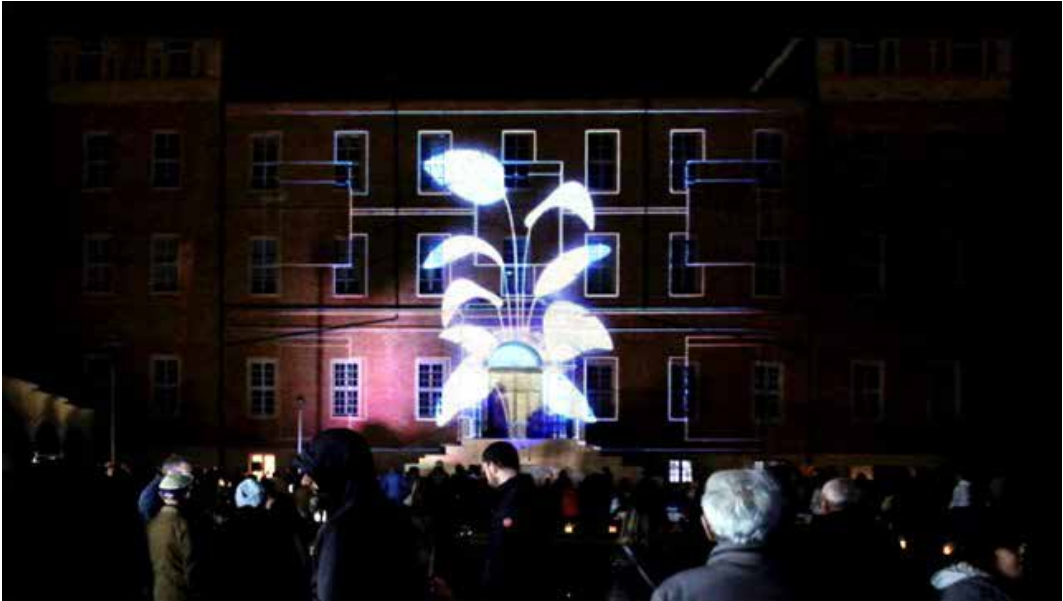
Fig. 11 Teatro Carillon, Videomapping at Vinovo Castle, 2023.

even instantaneous between fantasy images, historical quotations and configurations of architecture, which become stimuli to approach culture in a playful way.