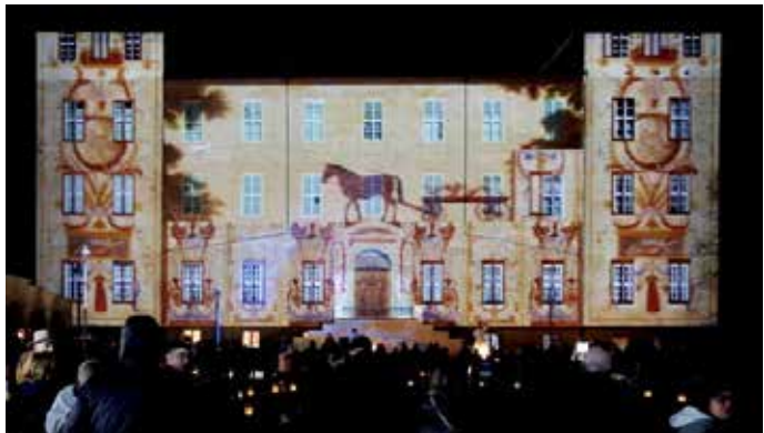
Fig. 8 Teatro Carillon, Videomapping at Vinovo Castle, 2023.