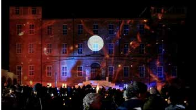
Fig. 4 Teatro Carillon, Videomapping at Vinovo Castle, 2023.