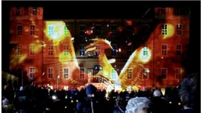
Fig. 6 Teatro Carillon, Videomapping at Vinovo Castle, 2023.