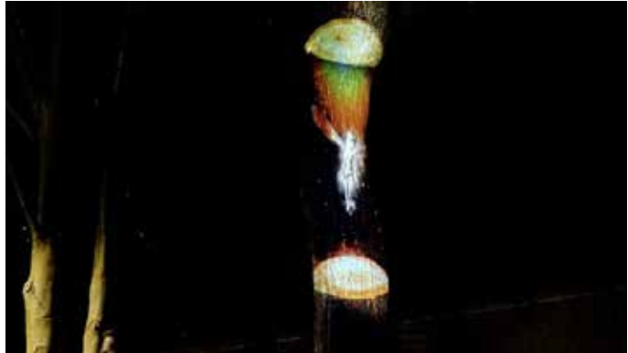
Fig. 2 Teatro Carillon, Videomapping at Vinovo Castle (garden), 2023.

hall in the square in front of the gardens. Once through the park gate, two fairy figures welcomed visitors, appearing projected on the trunks of the two trees on either side of the central path, which with an optical illusion seemed to appear floating between the two cut trunks (Figure 2). The show of projections that brought visitors inside a fairy reality was also completed by other theatrical performances.