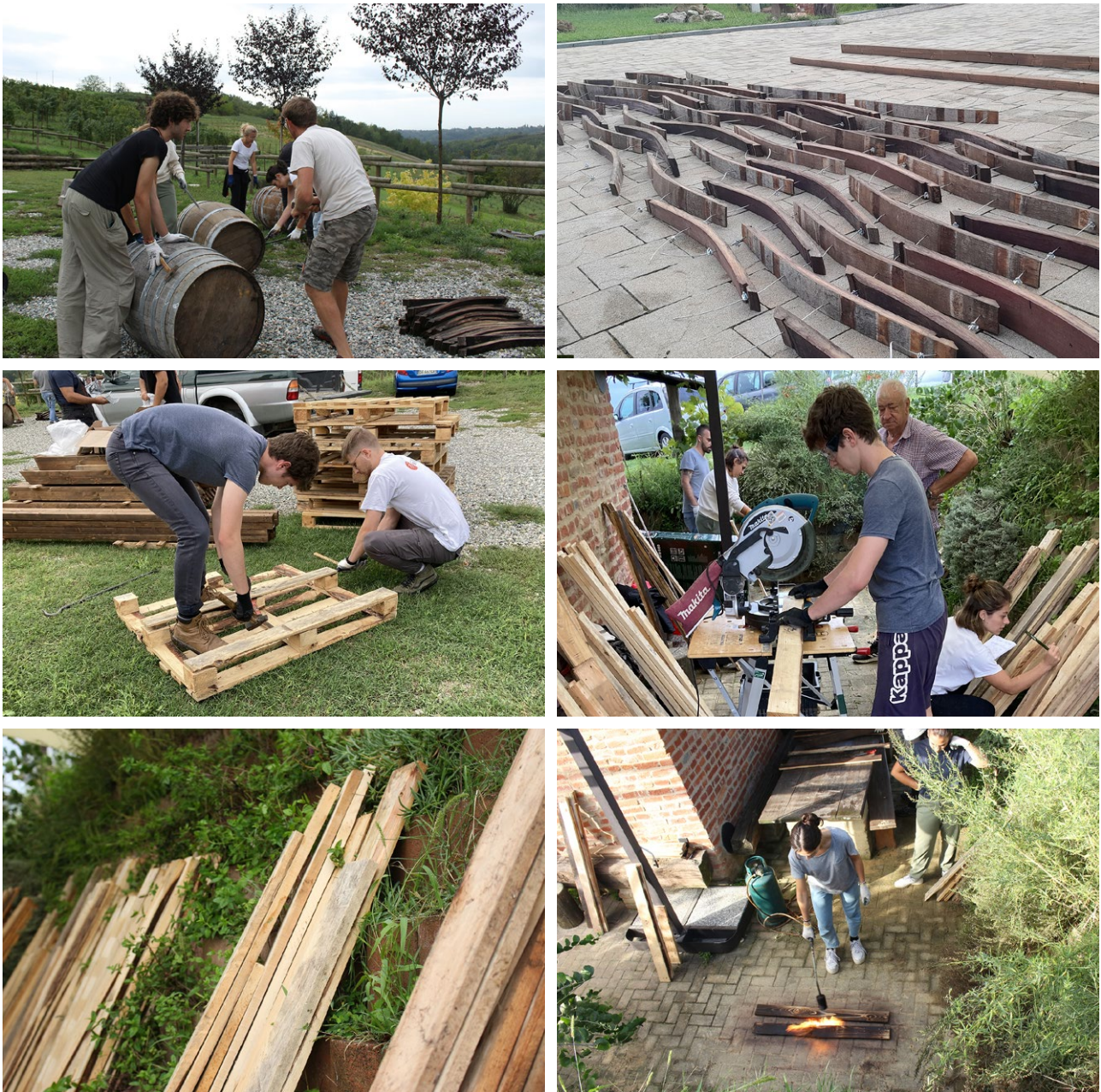
Figure 5 | Some activities of the off-site production phase: above, disassembly of the staves of the old barrels and anchoring on steel cables; middle and below, unnailling, selecting, cutting, and burning the planks recovered from the decommissioned pallets).