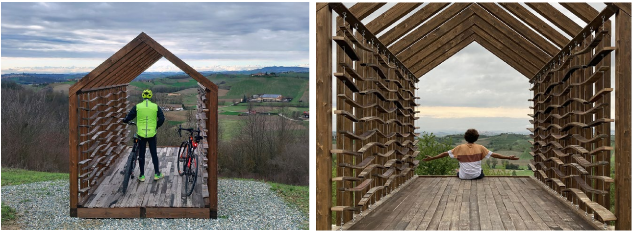
Figure 8 | People currently using CiaBOT. On the left a cyclist at a rest, on the right a young man meditating ‘embracing’ the landscape.

the materials with the greatest impact on the project. The pallet planks for the floor were mainly used in a functional/technical way. In this case, replacing the used planks with a new material would have further affected the environmental cost of the project. However, these do not communicate their original origin and therefore, on a communicative level they contribute less to explicitly convey the idea of circularity and sustainability to the users of CiaBOT.