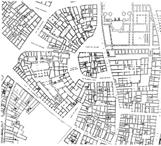
Figure 3. Rilievo murario al centro storico, Roma. Muratori S. , 1960

cancels the portions of time and their linear succession: it offers in the present an image of the city available to interpretations, comments, analysis, descriptions, of what is the nature of the past that influenced the city inherited in the present.