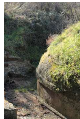
Fig. 4 The evocative relationship between architecture and nature inside a 5th century B.C. burial chamber