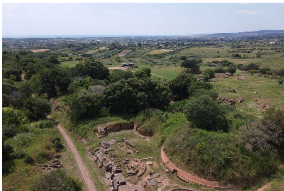
Fig. 13 The Altopiano dell'Affienatora and, on the left, part of the Necropoli dell'Autostrada