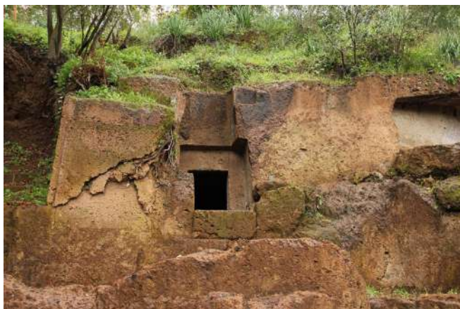
Figg. 19-22 Several situations in which the lignified roots of tree and shrub species have produced severe damage to artefacts