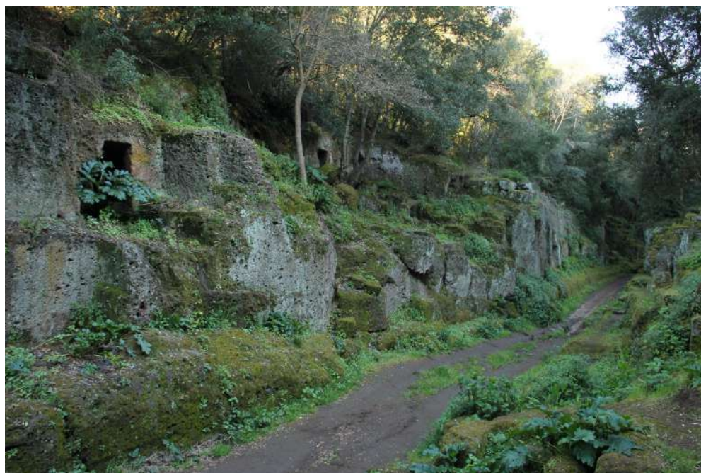
Fig. 9 The Via degli Inferi