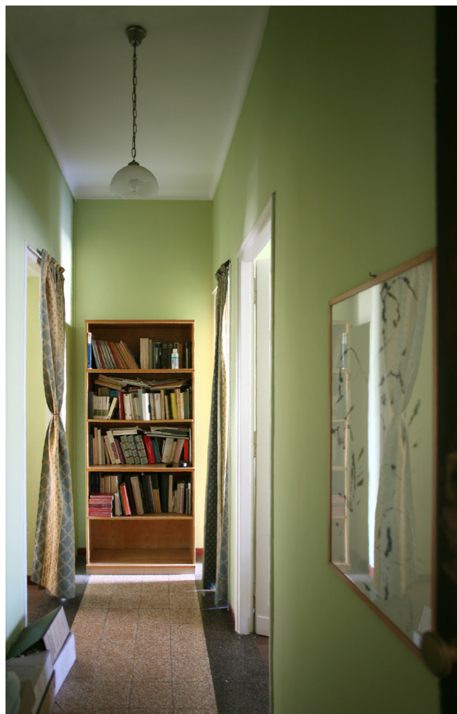
Figure 7.1: Franco Rosso's apartment: the entrance corridor.

study of archival sources with particular attention to the materials of construction. His primary and trademark research tool was the architectural survey, conceived as a personal, and often physically demanding enquiry into the anatomy and physiology of building (Cavaglia, 2021, p.89).