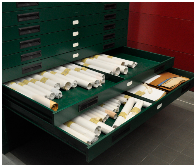
Figure 7.10: Drawings of the Franco Rosso Archive stored at the Archivio di Stato di Torino.

The act of archiving as a 'way of knowing' (Yaneva, 2020, p. 185) is not meant to lead to a closure or a final verdict, and therefore, these questions should