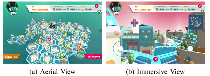
Fig. 1: Cityscapes

SMaILE-App uses a constructionist approach, therefore the users first play with a specific concept (experience stage), apply it (application stage), and only at the end is free to link it to the theory behind (theory stage). From a pedagogical point of view, each building type corresponds to a specific learning outcome. In particular, each part of the game is based on a fundamental concept of AI. In the TownHall building, players gain access to educational videos after playing the games for the first time. Typically, SMaILE-App offers one theory-focused video and another that provides practical strategies.