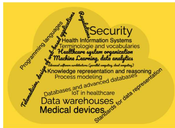
Figure 3. Most frequent topics in biomedical engineering programs (Created with WordClouds.com https://www.wordclouds.com/ ).

Ten out of the twelve responding sites have an active Biomedical/Clinical Engineering or Biomedical Computer Sciences degree with a track on eHealth. Several courses included in these tracks specifically address technologies supporting the process of personalizing medical treatment. Figure 3 shows a detailed view of the data we collected regarding the courses delivered in the bioengineering programs. Such courses are delivered both for undergraduate and for graduate students. Undergraduate courses usually deal with the fundamentals of medical informatics (standards, semantic interoperability, EHR, hospital information systems, telemedicine, software as medical device, UML modeling), as well as an introduction to the organization and processes included in the Italian national healthcare system. All the undergraduate programs also include courses related to databases and information systems, a basic course on image and signals analysis, and programming courses (Java, Python, C, Matlab). Graduate courses include advanced topics such as machine learning and artificial intelligence, ontologies, clinical guidelines, bioinformatics, telemedicine, advanced biomedical signal processing, and process modeling.