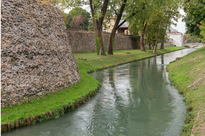
Treviso, Veneto Italy