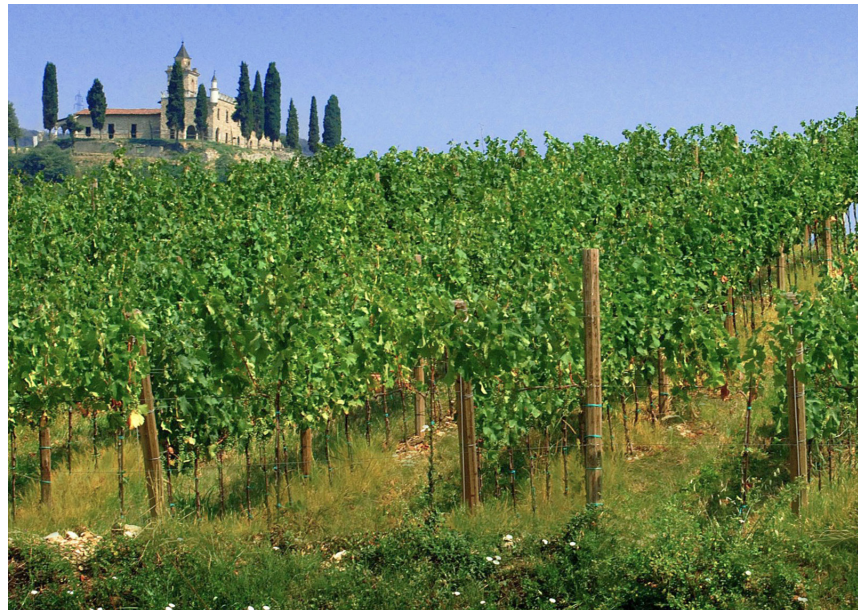
Franciacorta, Brescia Italy

systems, until the crisis that affected the whole of Europe from the 1970s onwards. Over the years, production delocalization practices and competition from Asian markets have pushed some companies to specialise in high quality processing and in some cases to focus on environmental and social sustainability issues. In some realities, the production chain has focused, also by acquiring raw materials from abroad, on renouncing the use of chemical additives that are useful in the production process but harmful to the natural environment, the workers and the end users. Even in the absence of binding European regulations and in the context of unclear policies in green labelling, some companies, including Filmar, which supplies the yarns for the collection, have initiated corporate policies aimed at sustainability that have favoured collaborations with other companies and implemented employment in the area. It represents a good practice of international exchange and contact between ways of managing shared problems, declining them on a local scale, in abandoned or underestimated areas, through adaptation to the specific sensitivities of the user public.