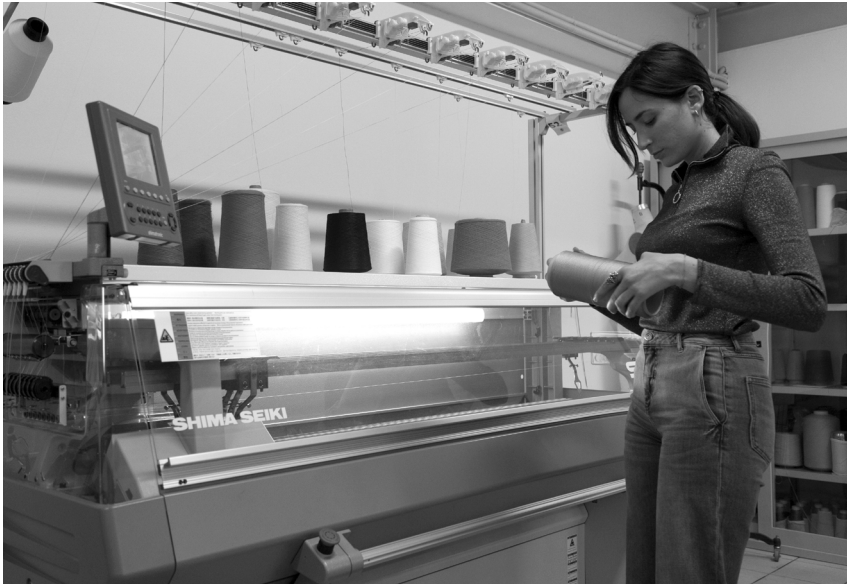
Workshop of Cap_able

onto a knitted fabric that can be used to detect people in real time. Using computer vision, tested with the most common of the object detection system tools (YOLO), a simple action on the pattern taken by the knitted yarn allows privacy to be safeguarded. The specialised needs of the start-up stimulate further collaborations with various stakeholders who in turn specialise in actions that coincide with the project's broad mission: manufacturers of sustainable and certified yarns, specialists in technologies related to controversial topics such as personal data privacy. In this way, a valorization of various production clusters and their employees, skills refinements and connections between hard skills and behavioural changes is realised.