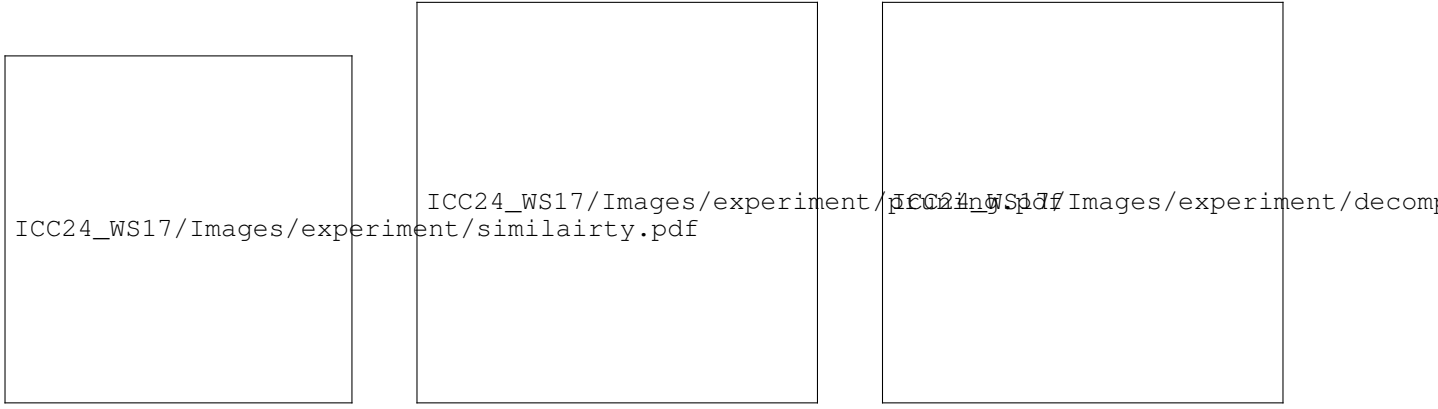
Fig. 3: Analysis on YOLOv3's head model output tensor and CoTeD operations: (left) Video frame/activation tensor similarity; (center) CoTeD-Pruning effects; (right) CoTeD-Decomposition effects. Black bars denote standard deviation.