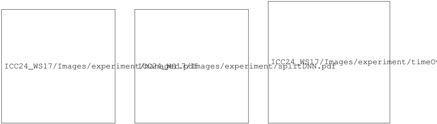
Fig. 4: (left) Activation tensor compression managed by CoTeD-Manager; (center) Averaged per-frame processing time (with standard deviation plotted in black bars) under different deployment scenarios; (right) Overall delay introduced by different techniques.

the transmission delay from the UAV to the edge) and the corresponding data size to be transferred for each video frame, when the communication bandwidth on the radio link is fixed at 50 Mbps. The plot compares the performance achieved by the edge deployment, the CoTeD split. When the whole DNN is deployed at the edge, the large raw video frames have to be transferred on the radio link, which always gives the largest transmission delay. For the split deployment, our CoTeD framework greatly outperforms its alternatives, in which the tensor reconstruction at the edge for CS and the tensor transmission for JPEG-100 take the longest time. Also, notice that the delay introduced by CS and JPEG-100 are at seconds or sub-seconds level, i.e., much higher than the video frame deadline requirement. To summarize, CoTeD provides a controllable activation tensor compression and transmission, which allows the split DNN's head and tail to meet the video frame deadline while effectively reducing the amount of data transferred over the radio link.