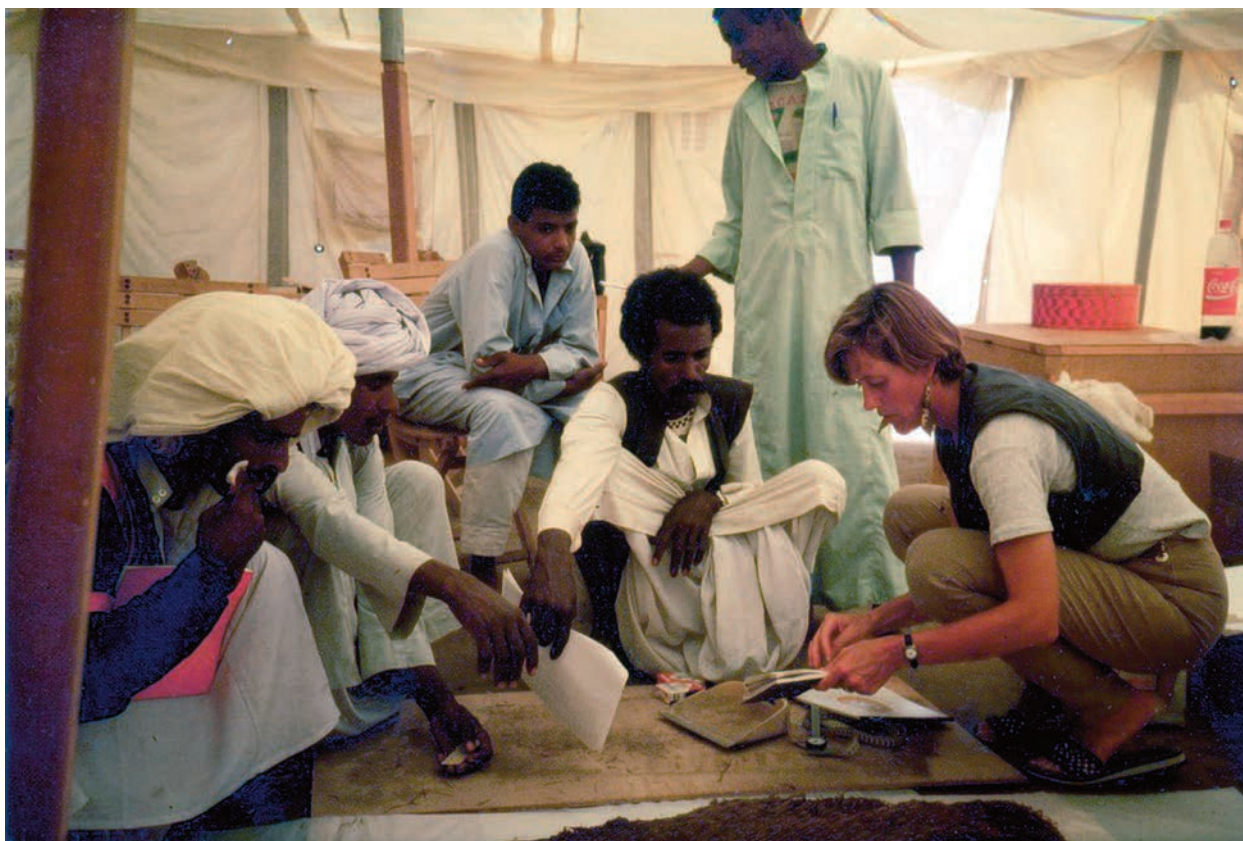
FIGURE 3: Ababda training program in Berenike.

from Quft. It meant that we needed to train our local collaborators in basic excavation techniques, rather than have them supervised by an experienced foreman from Quft. In the complicated social network of the Red Sea mountains, this was a good approach. The Ababda comprise a number of "tribes" ( kabila ), each with a sheikh who represents their interests. These groups differ in the way they interact with "Egypt," meaning the Nile Valley and those towns along the Red Sea coast that are under tight control of the Egyptian government. In the 1990s in an area of 5 km around the ancient site, one group was settled in government-built concrete houses, in a village which also had a large government provided water tank, a defunct clinic and a school. The other group lived spread out in the landscape and the wadis of the Eastern Desert. The excavation had to make sure that the men hired to work with us were divided equally between these two major tribes. A third group, consisting of young Ababda men who were from families that had settled in the Nile Valley, came to work with us as