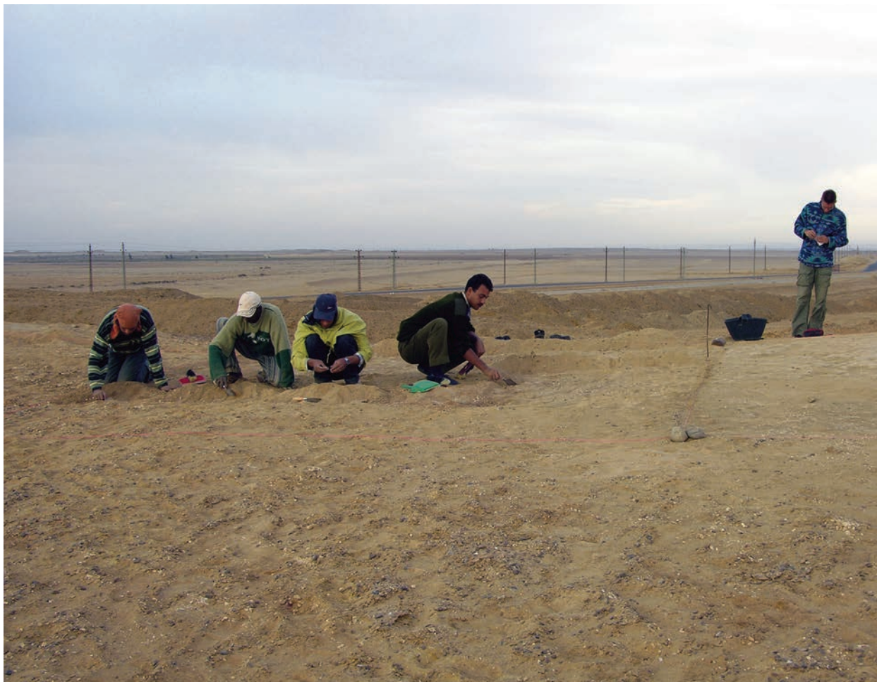
FIGURE 5: The Fayum Neolithic Team, including inspector Ashraf Sobhy and policeman Mustafa Ayoub (URU Fayum Project).

Archaeological method, theory and practice today need to take into account insights from poststructuralist, postcolonial, and gender theory critiques. The way to do this is to be well aware that the current research relationships are determined by a past and present built on inequality. Six guidelines