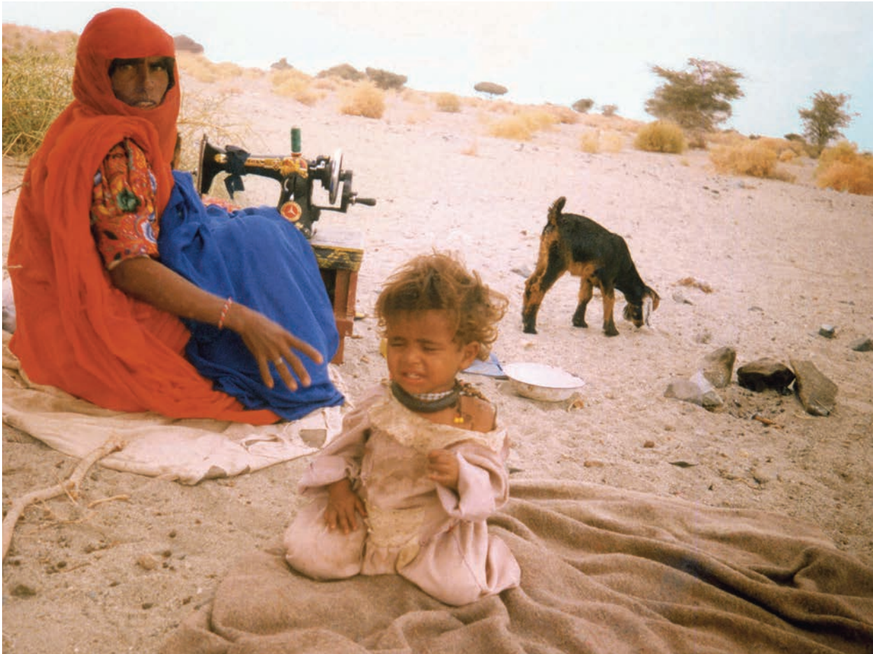
FIGURE 4: Sewing clothes in the desert.

In the first place they selected everything that is needed for the coffee ceremony: a coffee roaster, mortar and pestle to powder the coffee, the jabana coffee pot and the basket in which it could be transported, a wooden carved sugar pot, a basket containing 6 small porcelain coffee cups, a ring to support the jabana , a round mat to fan the fire. The second group of objects were all elements needed to deck out a camel: riding saddle, blanket, saddle bags, tassels, head gear, and a rider's leg protection. The third group of items were a dagger, shield and sword, the last two part of a man's gear, but nowadays only used in a dancing ritual.