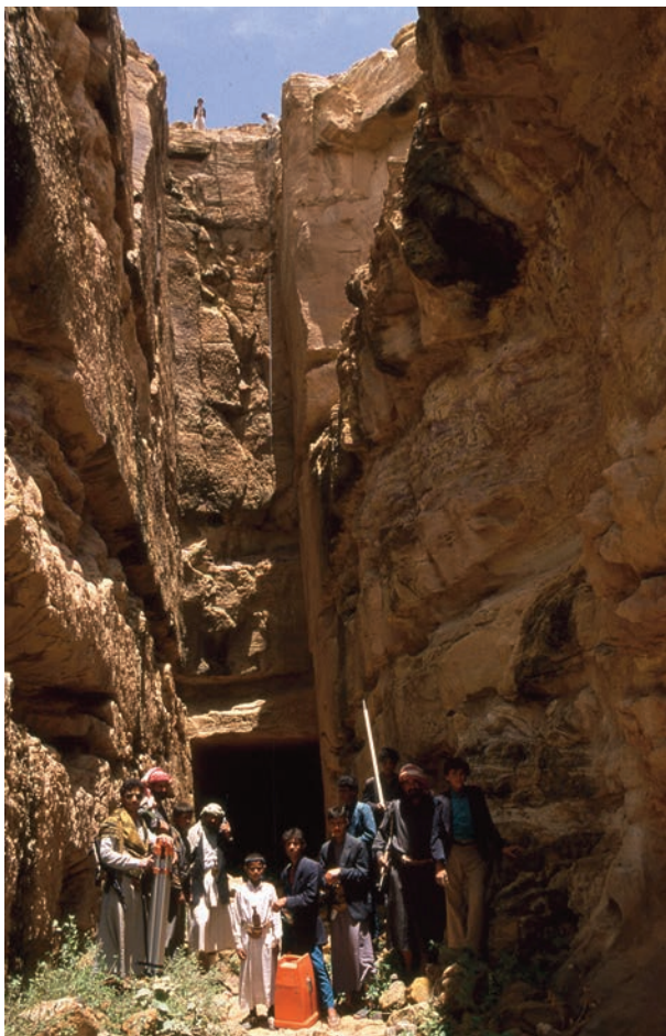
FIGURE 2: (a, above; b, below) Survey assistants carrying ranging rods, tripods and kalashnikoffs. Baynun, Yemen, 1997.