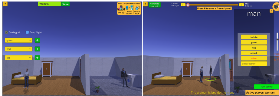
Fig. 3. The 3D virtual stage interface (on the left) and the 3D storyboarding interface (on the right).

3D Virtual stage The system enables users to add, move, or delete 3D assets to the scene. Figure 3 shows the user interface of the virtual staging (on the left). Three dropdown menus let the user choose among environment assets, objects, and characters. Selecting a 3D asset, the user can move, remove or rename it. Whereas move and remove can be obtained through shortcuts, rename is useful for changing characters' names and using them instead of the default value in the automatic text generation for the vignettes' descriptions. Once the 3D scene is ready, the user can save it, move back to the initial menu, or proceed with the storyboarding step.