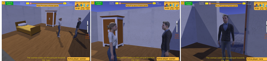
Fig. 4. Three different camera views for the same scene.

Finally, a button/shortcut lets the user insert a save point in the stack, taking a screenshot of the scene based on the current view, adding a vignette to the storyboard, automatically generating the textual description, and adding the camera focal distance. Each vignette’s tuple image/description is saved in an HTML template, and the textual description can be eventually edited.