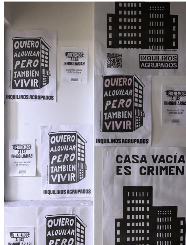
Figure 5 Posters in IA space.

Gervasio: In Buenos Aires, there are various rental types. There are Airbnb rentals for tourists and also for local residents. Besides these, there are hotels, guesthouses, and tenements. An emerging trend is renting in villas , 4 which are popular neighborhoods. This trend is highly symbolic of our current conditions. For example, someone living in a villa might build 20 rooms and charge exorbitant rents for life in substandard conditions. On one hand, we have salaried workers renting, and on the other, a proliferation of subletting in different areas. These situations coexist in Buenos Aires. However, in Rosario, Santa Fe, a key agricultural and drug trafficking hub in Argentina, drug money laundering significantly impacts housing access. Here, the real estate business operates distinctively. Agribusiness surplus funds construction in pesos, with sales in dollars, often resulting in vacant properties.