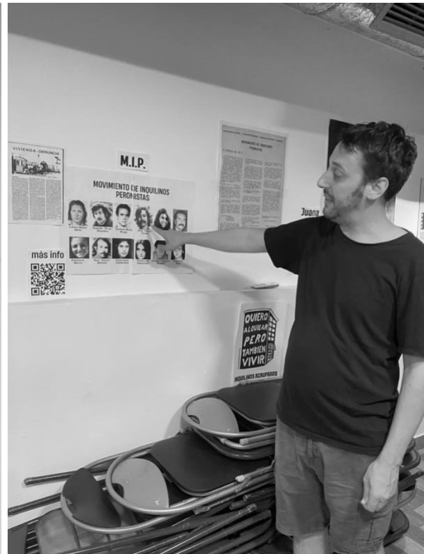
Figures 2 & 3

Figure 2 (left): Communication of Movimiento de Inquilino Peronista at the wall of IA space.