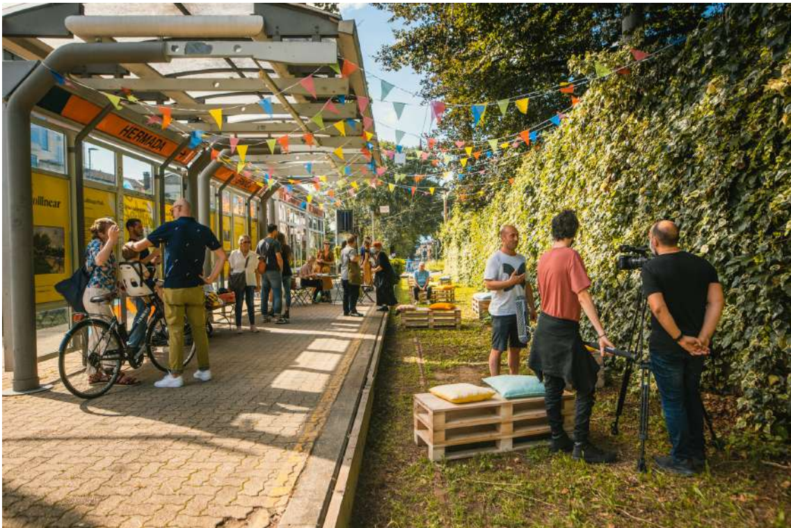
Fig.3 Regenerated Tram stop in Piazza Hermada.