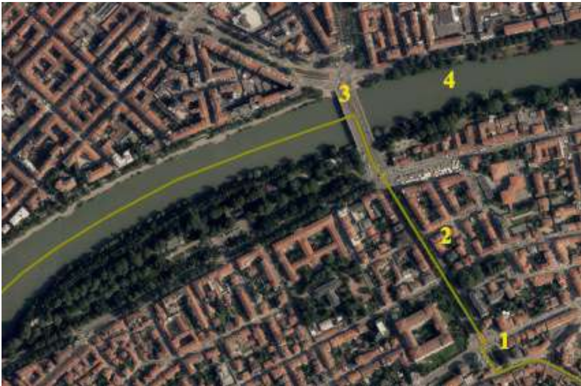
Fig.1 – Area of the intervention.