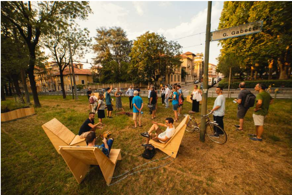
Fig.2 – Benches in Corso Gabetti.