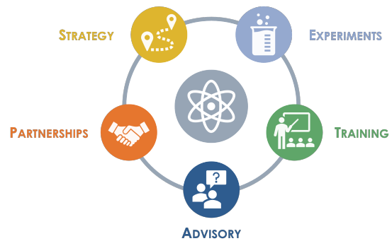
Fig. 2: QCC Objectives.