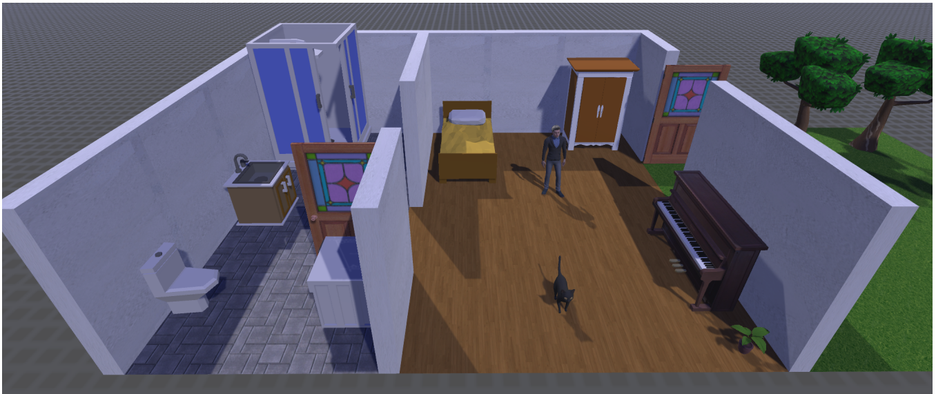
Fig. 1. A sample virtual stage created with the proposed system.

different way to provide users the same functionalities of the desktop version. The system enables the user to set up the virtual stage, adding elements to the scene by choosing among environmental tiles, objects, and characters (Fig. 1). After that, users can select the available characters or the camera, control them in first person, position them in the scene, and perform actions from a set of possibilities, each paired with a corresponding animation. To this end, an IVR can enable users to control 3D actors from a first-person point of view with a greater sense of presence and identification than desktop applications. The list of available actions is generated relying on the concept of state-machine, with each state depending on the context: the position in the virtual world, the proximity with other objects or characters, and the record of actions previously performed. This way, the system can automatically generate the descriptions for each storyboard panel based on this state-machine approach and the activities' history .