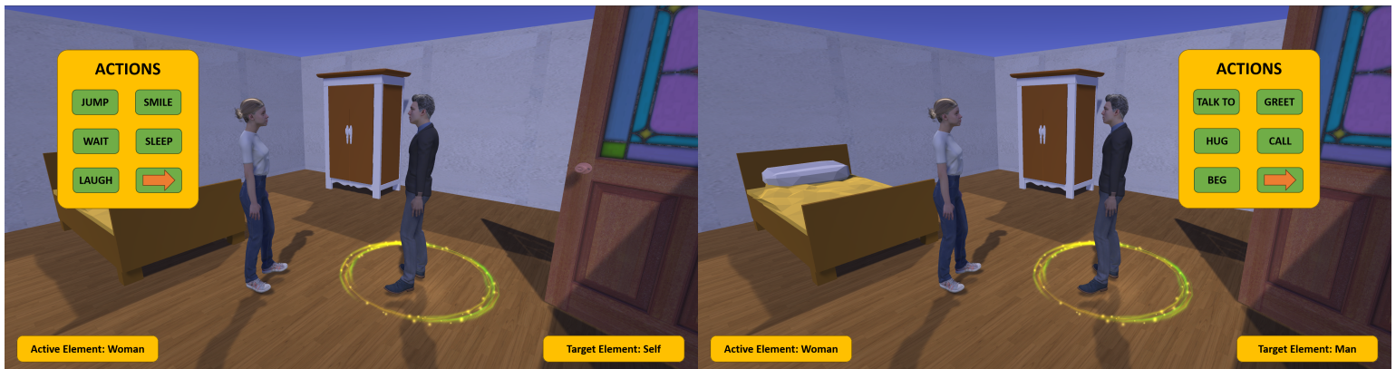
Fig. 2. An example of the UI panels available to select the actions based on the active actor (the woman) and the target (the woman herself on the left, the man on the right).

between the two views only affects the functionalities available to the users.