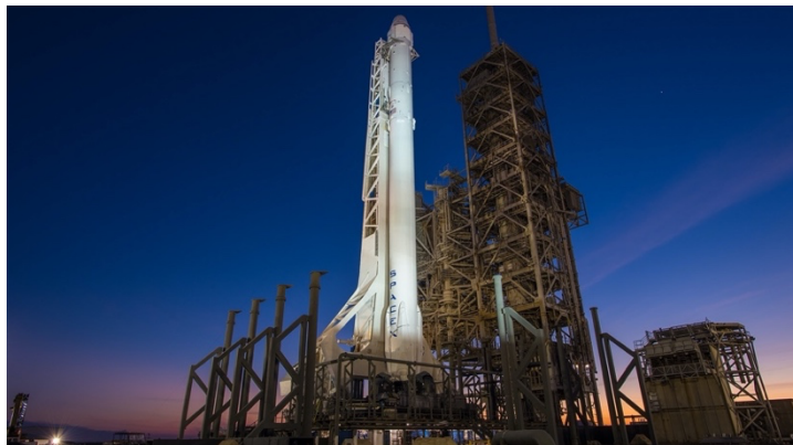
Fig. 2. Falcon 9 rocket with Dragon capsule.

The current space scene has different stakeholders involved with launches of cargo and astronauts into space, such as NASA (National Aeronautics and Space Administration), ESA (European Space Agency), and CNSA (China Nation Space Administration). In these last few years, private space companies started emerging and infiltrating into a field that has always been led by government space agencies. Two examples of this are SpaceX, founded by Elon Musk in 2002, and Blue Origin, founded by Jeff Bezos in 2000. Therefore, collaboration between private and government space agencies has become crucial for the development of this field and to widen the horizons of space exploration. This cooperation brings novelties to launch systems since it is now customary for private space agencies to provide vehicles for government space missions. Falcon 9 (see Fig. 2) is an orbital reusable two-stage rocket developed by SpaceX and used by NASA to transport astronauts to the ISS. It is a 50 meters rocket with a payload capability to low Earth orbit (LEO) of 22.8 tons [13].