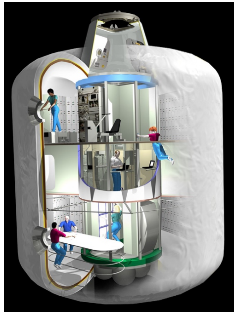
Fig. 1. View of the TransHab [5].

The TransHab (see Fig. 1) is an inflatable habitat designed in 1997 by a team of architects and engineers from the Johnson Space Center, headed by Doctor William Schneider.