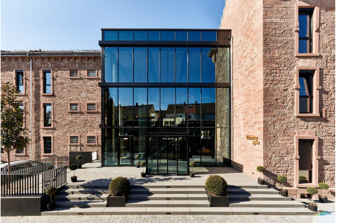
Figure 1) Liberty Hotel: connection between old and new, Jürgen Grossmann, 2017, Offenburg, Germany