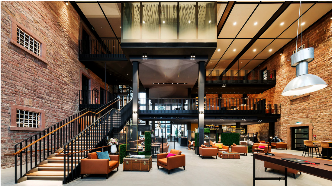
Figure 2) Liberty Hotel: interior of the new glass building, Jürgen Grossmann, 2017, Offenburg, Germany