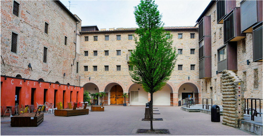
Figure 7) Le Murate: a new public square surrounded by the restored buildings of the former prison, E.R.P. Office of the Municipality of Florence, 2014, Florence, Italy

for young couples and services for young people and workers; it is also a centre for the contemporary art, where shows, exhibitions, meetings, conventions, and opportunities for exchange, comparison and cultural growth among different cultures are held.