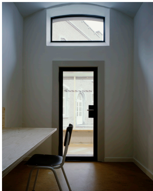
Figure 5) Hasselt University: access corridor to auditorium and study cell, noArchitecten, 2015, Hasselt, Belgium