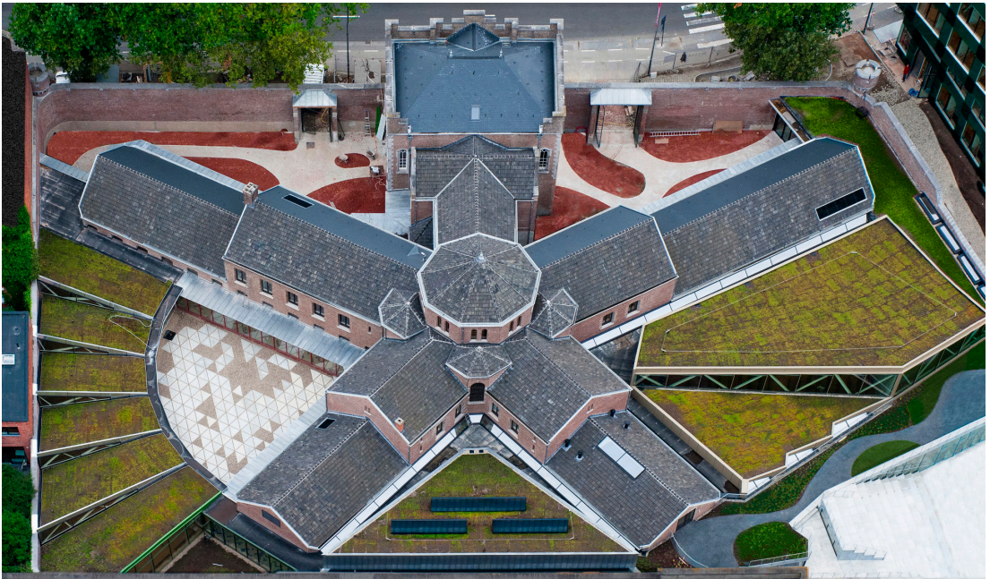
Figure 4) Hasselt University: aerial view of the former prison and new additions, noAr- chitecten, 2015, Hasselt, Belgium