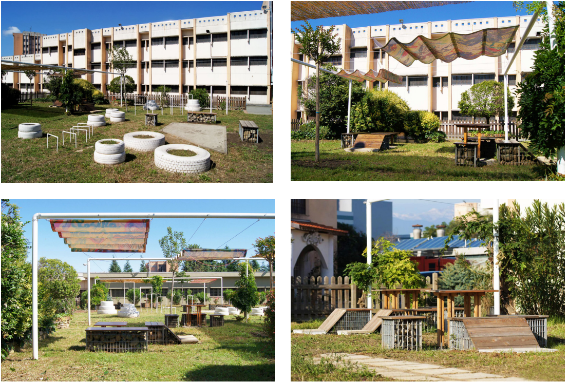
Figure 10) Lorusso and Cotugno Prison: open-air meeting space with some of the equipment made by students and prisoners, Spaziviolenti student team, 2015, Torino, Italy

The unused area of about 1000 sqm. was equipped with eleven conversation areas and a playground for children. Each meeting place is shaded by a system of movable fabric curtains and is equipped with modular seating and tables arranged in different patterns. The children's games are scattered among the adults places. All furniture were realized by students and inmates in a process of participated design using recycled materials found in the prison structure.