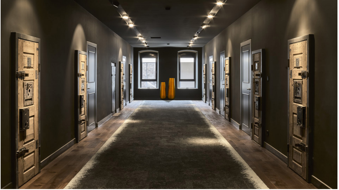
Figure 3) Liberty Hotel: room corridor, Jürgen Grossmann, 2017, Offenburg, Germany