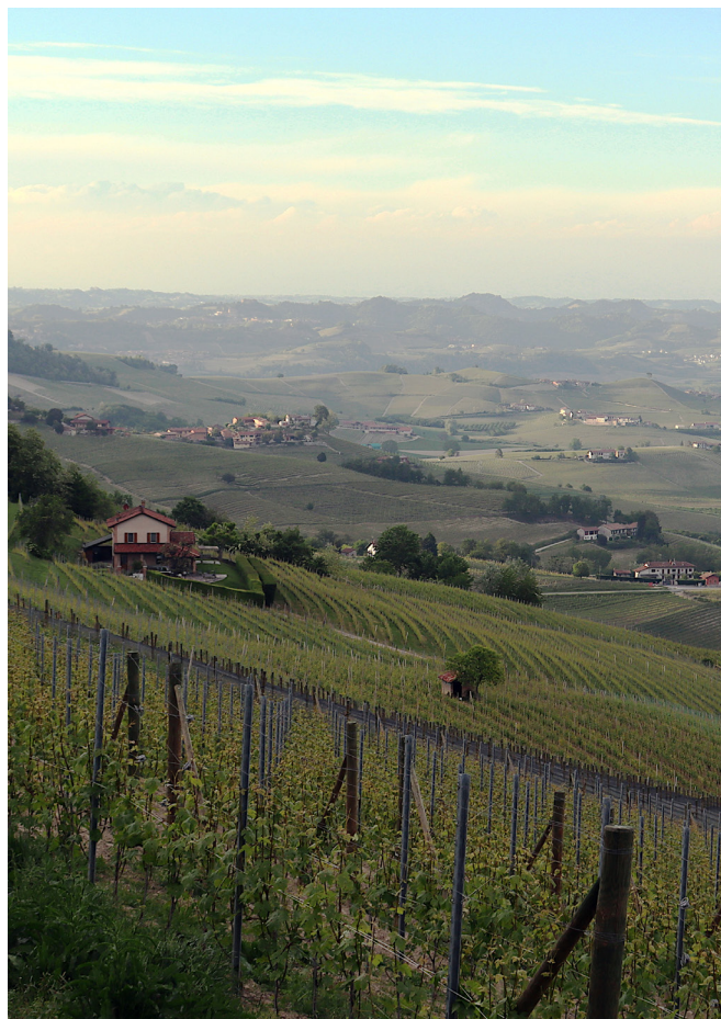
Fig. 1. Monocultural landscape of Langhe

of the Langhe and three in the Monferrato. The landscape components were selected to exemplify the significant places of winemaking from cultivation to production, from conservation to distribution, retracing and emphasizing all the elements that distinguished them in the production process, the historic settlement and architectures, road networks, etc. Each area is linked to specific a wine grape variety, a terroir , a winemaking technique, or significant historical places, ranging from castles to artefacts of a vernacular nature, for the history and development of wine growing and winemaking on a national and international scale. The structure of the native vineyards is distinctive: they are planted around the hilltops with moderate or gentle slopes characterised by the absence of walls and terrain, resulting in a systematic arrangement of rows running along the oblique curves of the hillside. All these elements have created a district in a unitary and complete geographical reality: it has made the cultural heritage capable of fortifying and shaping the identity of the UNESCO landscape.