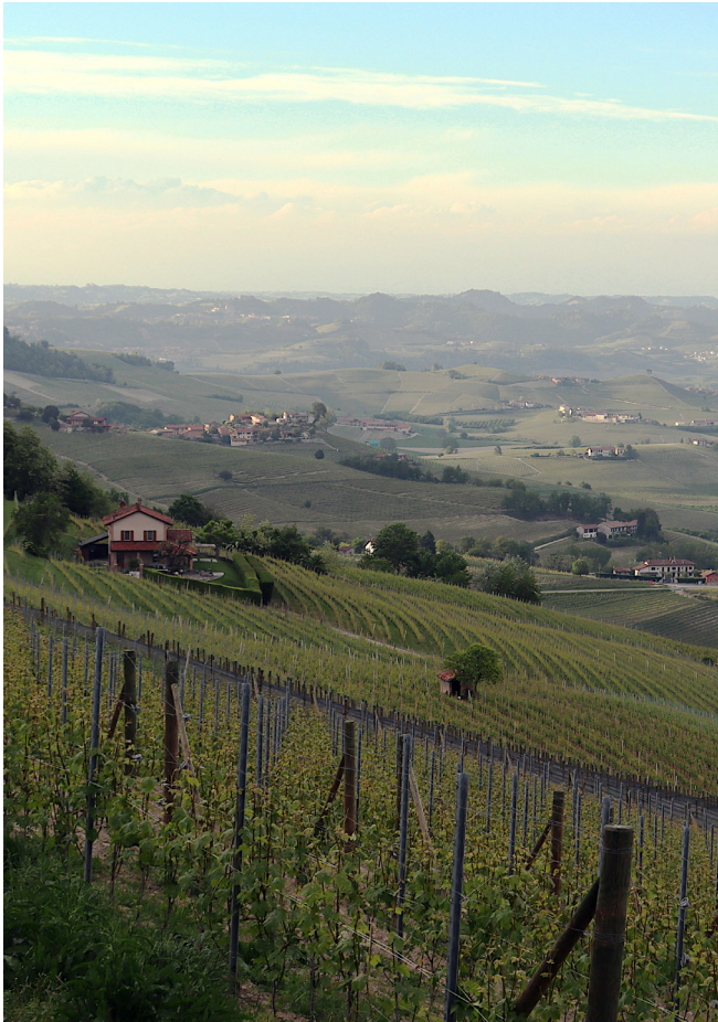
Fig. 1. Monocultural landscape of Langhe

of the Langhe and three in the Monferrato. The landscape components were selected to exemplify the significant places of winemaking from cultivation to production, from conservation to distribution, retracing and emphasizing all the elements that distinguished them in the production process, the historic settlement and architectures, road networks, etc. Each area is linked to specific a wine grape variety, a terroir , a winemaking technique, or significant historical places, ranging from castles to artefacts of a vernacular nature, for the history and development of wine growing and winemaking on a national and international scale. The structure of the native vineyards is distinctive: they are planted around the hilltops with moderate or gentle slopes characterised by the absence of walls and terrain, resulting in a systematic arrangement of rows running along the oblique curves of the hillside. All these elements have created a district in a unitary and complete geographical reality: it has made the cultural heritage capable of fortifying and shaping the identity of the UNESCO landscape.